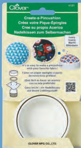
Art No. 4121 Ivory