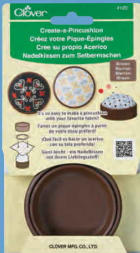
Art No. 4120 Brown