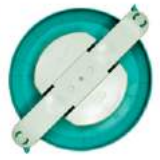
(Extra Large) Art No. 3128