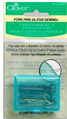
Fork Pins Art No. 240