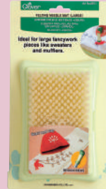
Felting Needle Mat (Large) Art. 8911