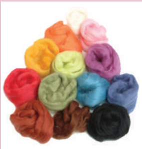
Wool Roving Art No. 7940, Art No. 7941, Art No. 7942