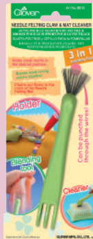
Needle Felting Claw & Mat Cleaner Art. 8919