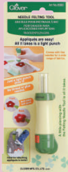
Needle Felting Tool Art. 8900

Felt Sheet 8.5" x 11" Light Weight Yarn Size 6 Seed Beads *Silk Scarf