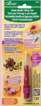
Single Needle Felting Tool Art. 8902