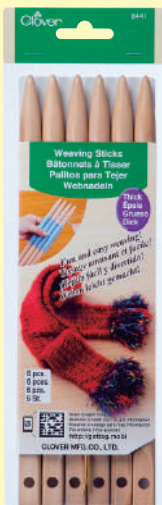
Weaving Sticks/ Thick Art No: 8441 $19.95 Shelf Pack 3/Case 72 051221784415