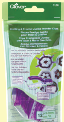
Jumbo Wonder Clips (12 pcs.) Art No.: 3166 $13.95 Shelf Pack: 3 ea. / Case:72 UPC: 051221 731662