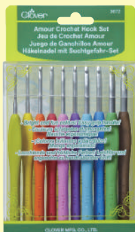
Amour Crochet Hook Set Art No: 3672 MSRP: $73.50 Shelf pack: 3 ea. / Case: 48 UPC: 051221 736728