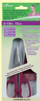
4940 NZ- Bordeaux Ultimate Scissors 130 MSRP: $55.00