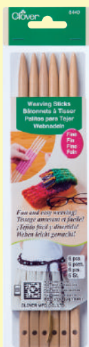
Weaving Sticks/ Fine Art No: 8440 $19.95 Shelf Pack 3/Case 72 051221784408