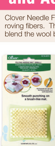
FELTING MATS Small 2 3/4 x 3 1/2" Item No. 8910