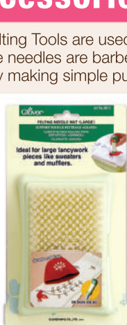
FELTING MATS Large 3 1/4 x 5" Item No. 8911