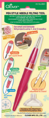
PEN-STYLE NEEDLE FELTING TOOL Item No. 8901