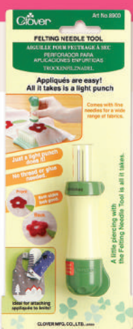
NEEDLE FELTING TOOL Item No. 8900