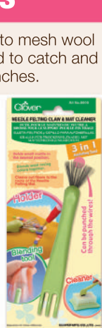
FELTING CLAW & MAT CLEANER Item No. 8919