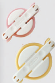
SMALL (2 sizes) Item No. 3124 Size approx. 1 3/8" and 1 5/8"