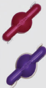
EXTRA SMALL (2 sizes) Item No. 3127 Size approx. 3/4" and 1"