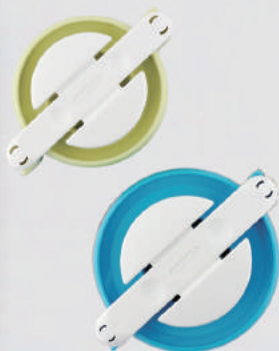
LARGE (2 sizes) Item No. 3126 Size approx. 2 1/2" and 3 3/8"