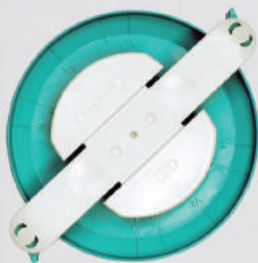
EXTRA LARGE Item No. 3128 Size approx. 4 1/2"