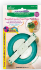
Art No. 3128 (Ex-Large) Approx. size 4 1/2"