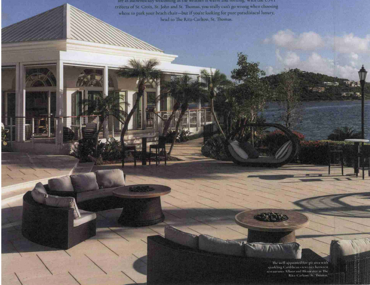
The well-appointed fire pit area with sparkling Caribbean views sits between restaurants Allora and Bleuwater at The Ritz-Carlton, St. Thomas.

What's the best way to describe the U.S. Virgin Islands? It's a U.S. territory where the temperature hovers at that sweet spot of 75 to 80 degrees year-round. You won't even have to check the forecast before you embark. It's almost always sunny, and the locals are as authentically welcoming as the weather is warm and inviting. With the USVI trifecta of St. Croix, St. John and St. Thomas, you really can't go wrong when choosing where to park your beach chair—but if you're looking for pure paradisaical luxury, head to The Ritz-Carlton, St. Thomas.