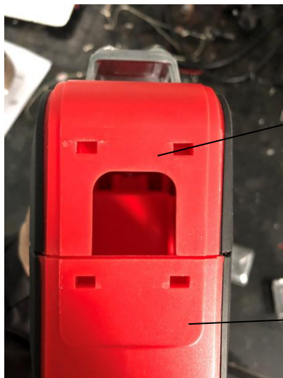
Vertical window B