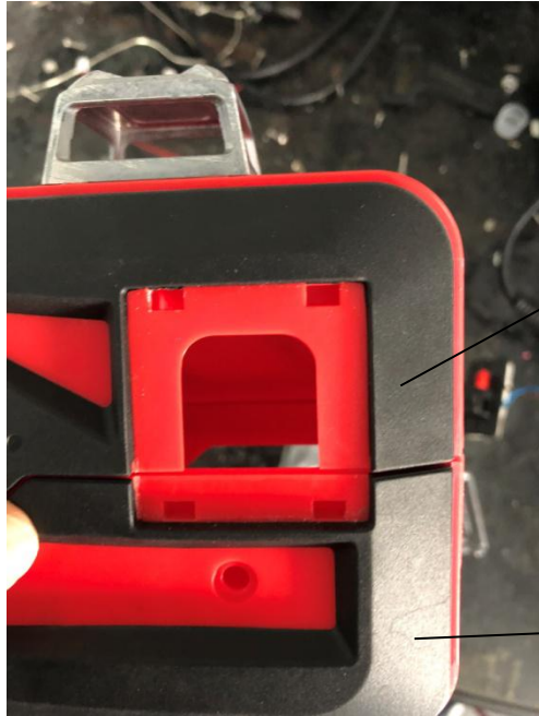
Vertical window A

Step 2 Take out broken vertical topping or window by separating upper and lower housing. Please Notice there are two vertical windows for 603 laser level.