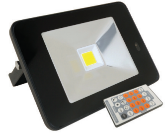
Code: | LEDFLOOD30W4KS-BLK