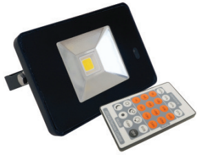
Code: | LEDFLOOD10W4KS-BLK