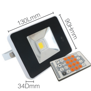
Code: | LEDFLOOD10W4KS-WH