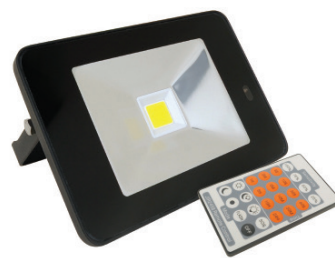
Code: | LEDFLOOD20W4KS-BLK