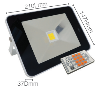
Code: | LEDFLOOD30W4KS-WH