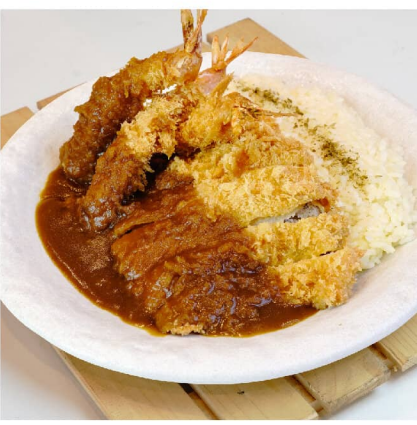
Ebi and Katsu Curry