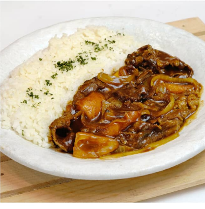
Beef Hayashi Curry