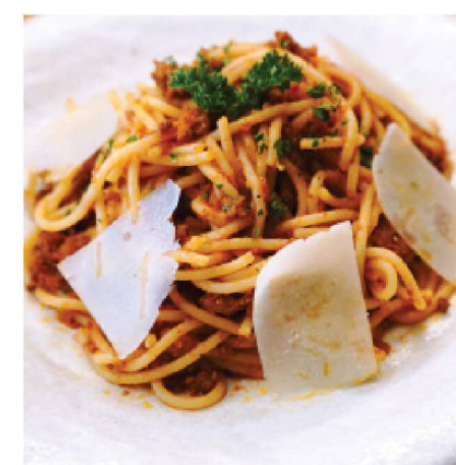
Gyu Bolognese Pasta