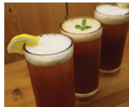
House Blend Iced Tea