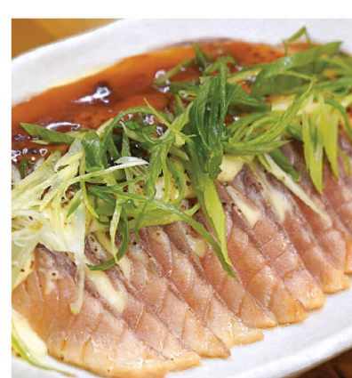
Salmon Teriyaki Gratin