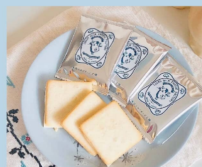
Salt & Camembert