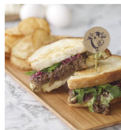
12-hour Short Rib Sandwich