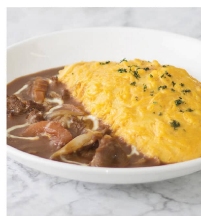
Hayashi Beef Omurice