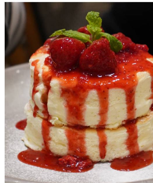
Summer Berry Pancake