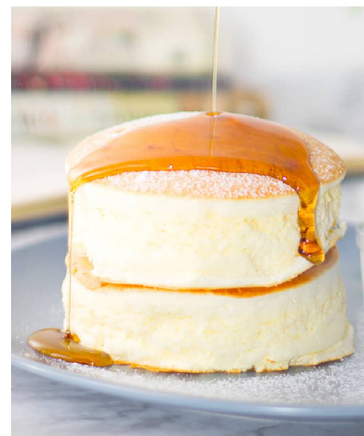
Original Japanese Pancake