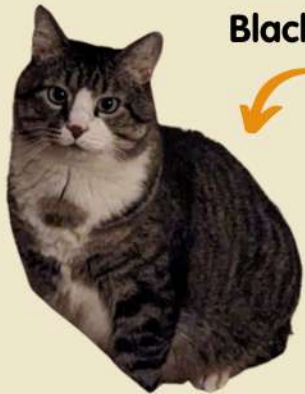
Blackwood 811 days in care!

Hi, I am Blackwood. I am looking for a calm and quiet home with someone patient and understanding who will give me the time and space I need to feel safe. I'm 4 years old.