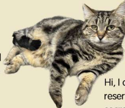
Gene 807 days in care!

Hi, I am Blackwood. I am looking for a calm and quiet home with someone patient and understanding who will give me the time and space I need to feel safe. I'm 4 years old.