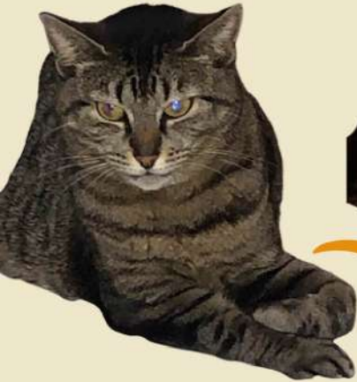
Miss Maude 547 days in care!

Hi, I am Gene, a sweet and reserved 4 year old girl, and am searching for my forever home. I came to Cat Haven more than two years ago after being found on the streets and have spent an extended time in foster care.