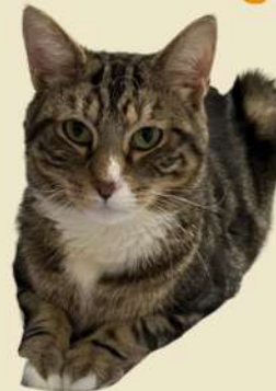
Limba 486 days in care!

I'm a shy but lovable cat who thrives in the company of other feline friends. I'm 4 years old.