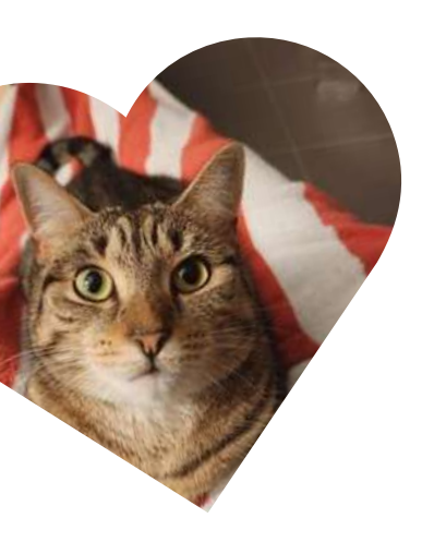
391 days in care