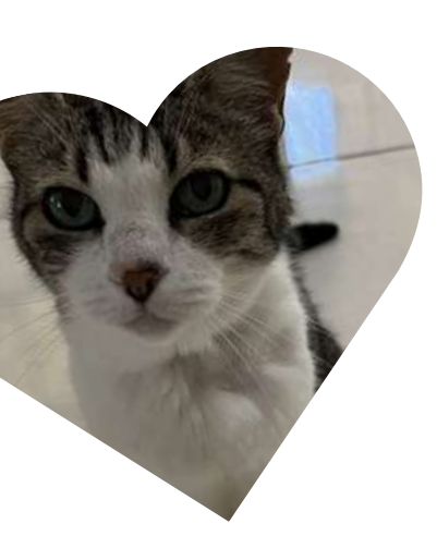
407 days in care