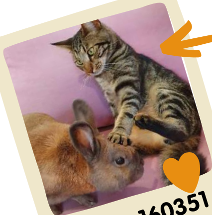
Tiger 160351 655 Days in care

If you would like to enquire about any of these cats or any cats we have in foster please email fostercare@cathaven.com.au there are so many more to view on our website www.cathaven.com.au/collections/cats-for-adoption