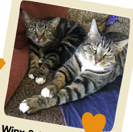
Winx & Mouse 145390 320 Days in care

Meet Blossom a 2 year old girl that LOVES chasing ribbons, felt balls and her favourite toy mouse. Blossom is a total foodie, wet food and creamy treats are her love language.