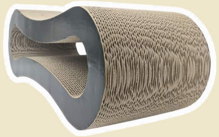
Playful Pedicure Scratcher $19.06