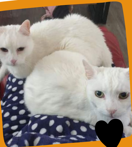
Meet Bobby & Moby