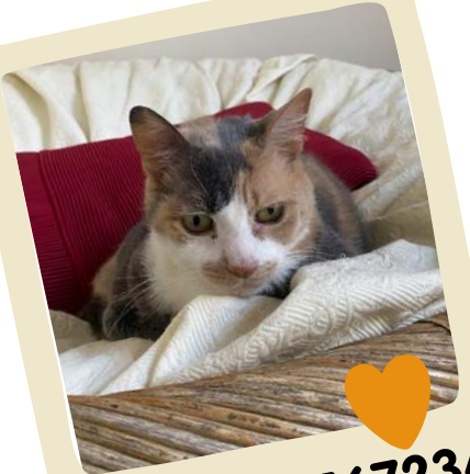
Theodora 167234 289 Days in care

Meet Naya, an 11 year old girl who is in need of a new home. She is a big fan of brushing and needs it for this magnificent coat. She needs a quiet home as she can get spooked quite easily.