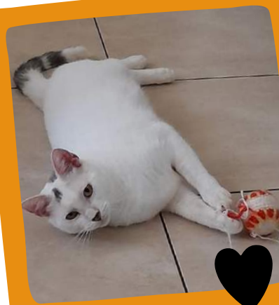
Meet Roh Rito

For the 31 days of July , a number of our cats in foster and on site are only $31 to adopt. Please give one of these cats a chance.