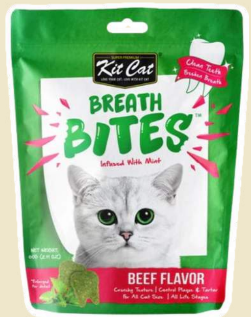
Kit Cat Breath Bites $5.17