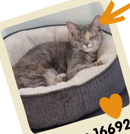
Blossom 166926 328 Days in care

Meet Blossom a 2 year old girl that LOVES chasing ribbons, felt balls and her favourite toy mouse. Blossom is a total foodie, wet food and creamy treats are her love language.