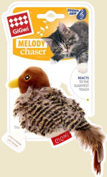
GiGwi Melody Chaser Bird $15.00