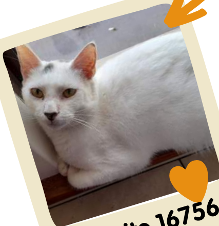
Roh Rito 167565 280 Days in care

Meet Theodora, or Dora for short. She is a 12 year old girl that needs your help to find a new home. At heart she is still a cheeky little kitten and we love her playful personality.