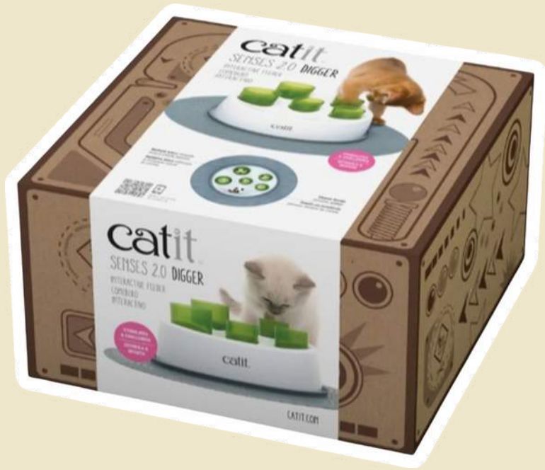
Catit Senses 2.0 Digger $24.00

Profits made from our store go directly to helping the cats