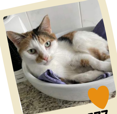
Tess 126577 330 Days in care

Meet Jazz, a 10 year old boy who is very sweet, gentle and affectionate. He loves a good cuddle and will lay in your lap or under the covers with you. Please take him home today.