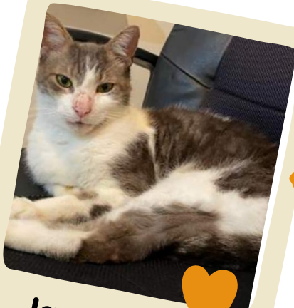
Jazz 166379 340 Days in care

Meet Dragon, a golden oldie at 18 years old. He has the softest fur and is learning to love his foster family more each day, do you have space in your heart to take in this beautiful old fella?