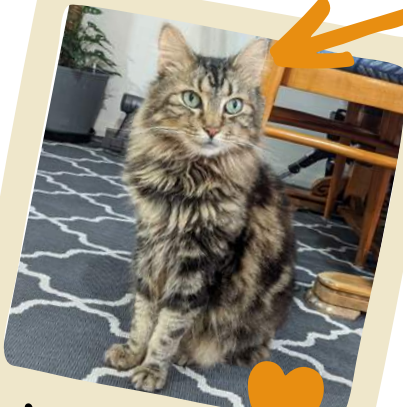
Naya 166402 316 Days in care

Meet Winx (4 years old) & Mouse (3 years old), they are the sweetest female and male pair, Mouse is the baby of Winx and they are the best of friends. They both love chilling on the couch and watching Netflix with you.