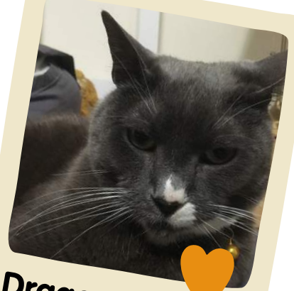
Dragon 166271 365 Days in care

Meet Tiger a 2 year old boy who is super confident and curious, he won't take long to settle into any house. He loves his foster companion the rabbit and he loves to spend his daily lunch break in the warm sunspot in front of the window.