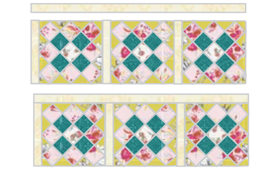
3. Sew C rectangle to the very end of the unit.

2. Sew B rectangle to the top of the granny square unit.