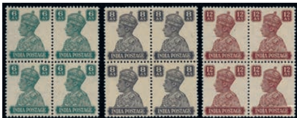
Ex Lot 818