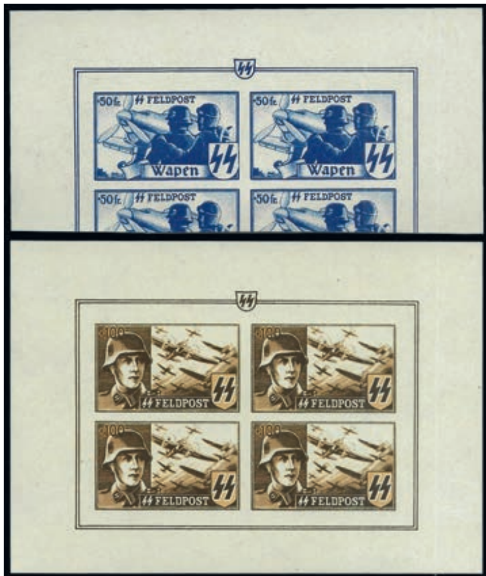
Ex Lot 713