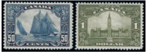
Ex Lot 336