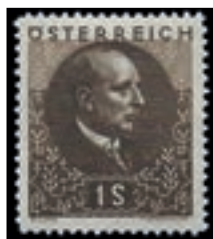
Ex Lot 255