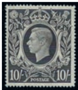
Ex Lot 564