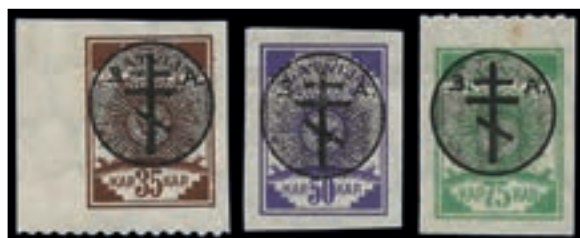
Ex Lot 1051