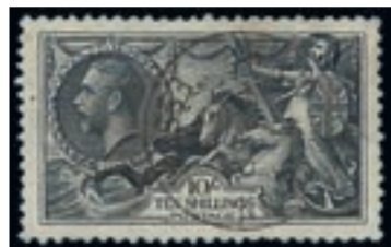
Ex Lot 561