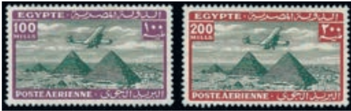
Ex Lot 381