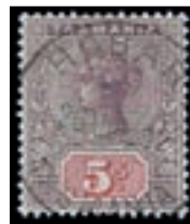
Ex Lot 252