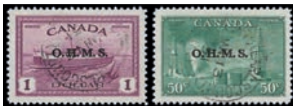
Ex Lot 326