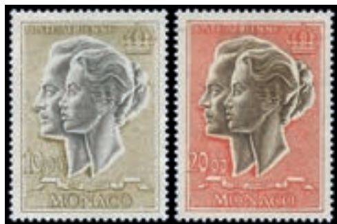
Ex Lot 938