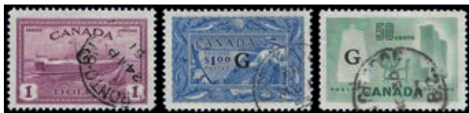
Ex Lot 327