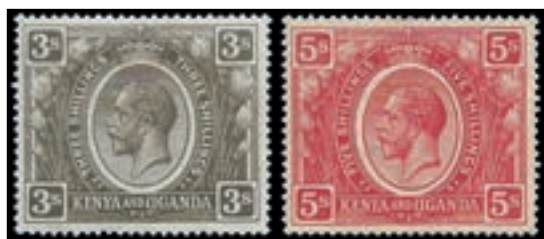
Ex Lot 868