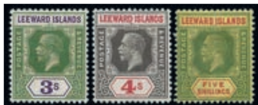
Ex Lot 885