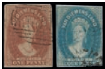
Ex Lot 244