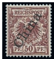
Ex Lot 644