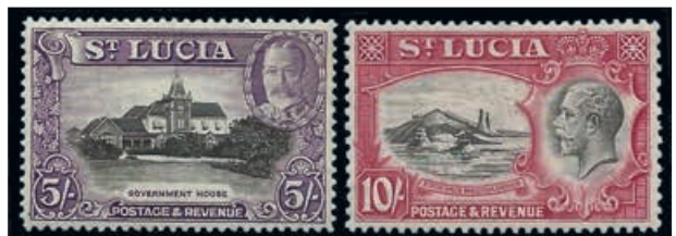
Ex Lot 1045