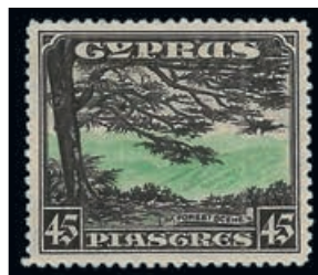
Ex Lot 356