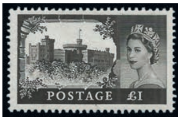
Ex Lot 534