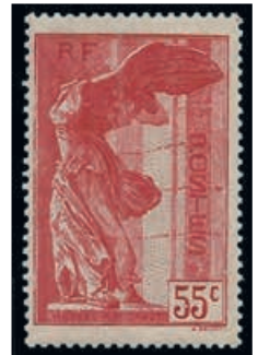
Ex Lot 442