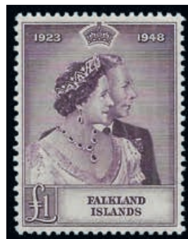
Ex Lot 401