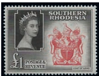
Ex Lot 1039