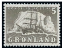
Ex Lot 742