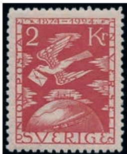
Ex Lot 1058