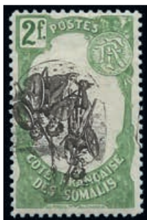
Ex Lot 482