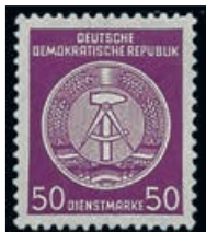
Ex Lot 690