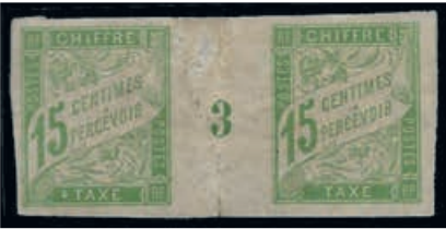
Ex Lot 427