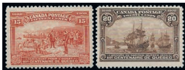
Ex Lot 317