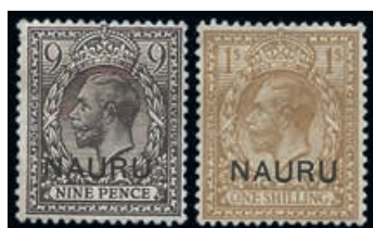
Ex Lot 896