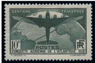
Ex Lot 437