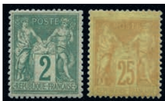
Ex Lot 425