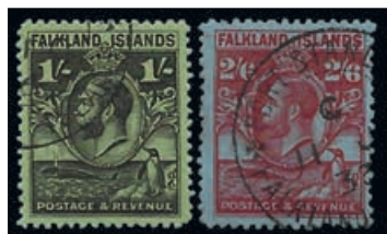
Ex Lot 397