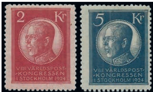
Ex Lot 1067