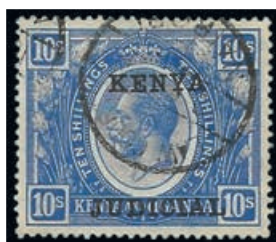
Ex Lot 829