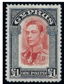
Ex Lot 360