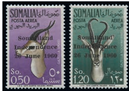
Ex Lot 1024