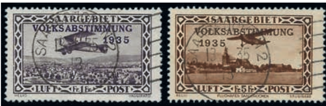
Ex Lot 1005