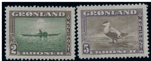
Ex Lot 741