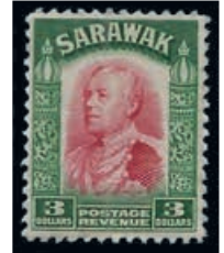
Ex Lot 1006