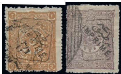
Ex Lot 1096