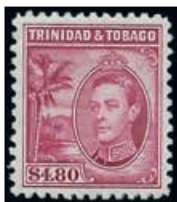
Ex Lot 1090