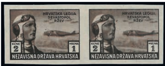
Ex Lot 350