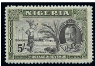
Ex Lot 944