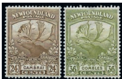
Ex Lot 932