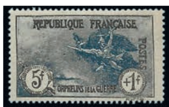
Ex Lot 432