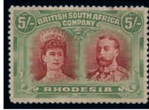
Ex Lot 994