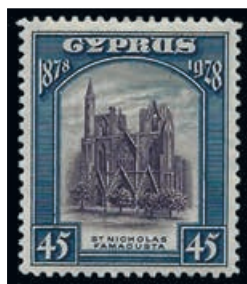
Ex Lot 355