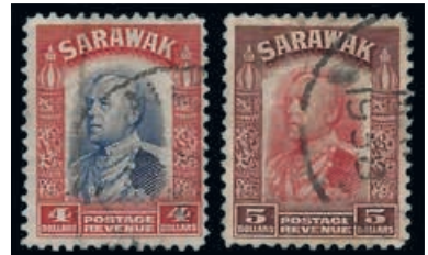
Ex Lot 1007