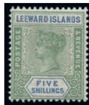
Ex Lot 842