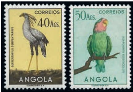
Ex Lot 168