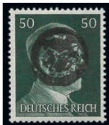
Ex Lot 698