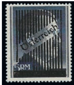
Ex Lot 213