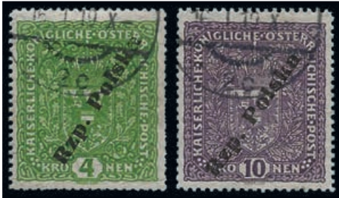
Ex Lot 984