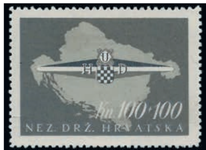
Ex Lot 349