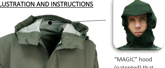
(patented) that moves with the head

Allows the wearing of a hard hat under the hood.