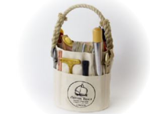
Arthur Beale Ditty Bags are great onboard for storing all those essential tools.