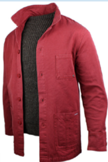
Authentic Saint James Jackets and Arthur Beale Oiled Wool Pullovers

ARTHUR BEALE London's Yacht Chandler - Established 400 years