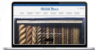
View all this and more on our BRAND NEW WEBSITE www.arthurbeale.co.uk

020 7836 9034 - sales@arthurbeale.co.uk - www.arthurbeale.co.uk 194 Shaftesbury Avenue, London, WC2H 8JP