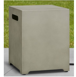
Mist Gray (T0025-MGRY)