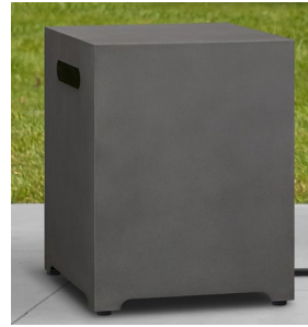
Weathered Slate (T0025-WSLT)