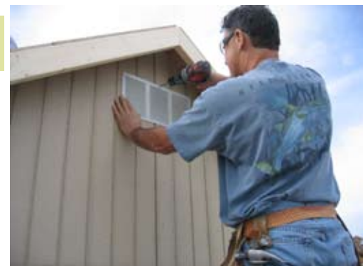
Install vents, secure with (6) 1 1/4" screws.