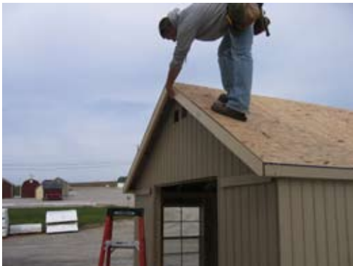
Make sure the OSB is flush with the outside of the rake.