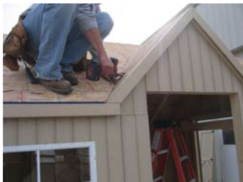
While someone is holding the v-channel in place on the inside, secure with 1 1/4" screws going through the OSB into the v-channel