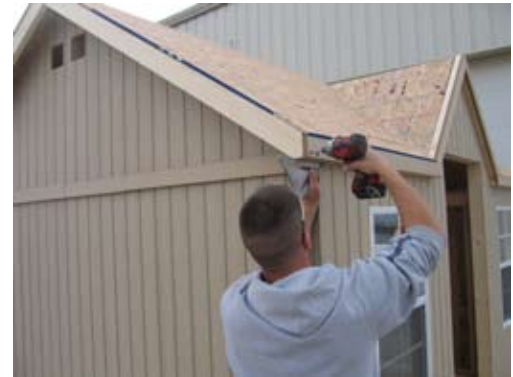
Secure rake with 2 1/2" screws as shown.