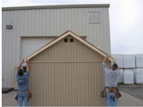
Install rakes as shown.