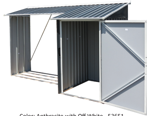
Color: Anthracite with Off White - 53651