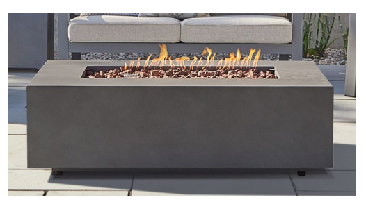
Available in Weathered Slate (C9813LP-WSLT)