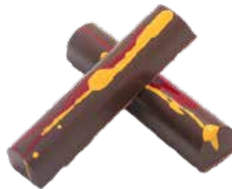
MILK CHOCOLATE PNB-M BAR