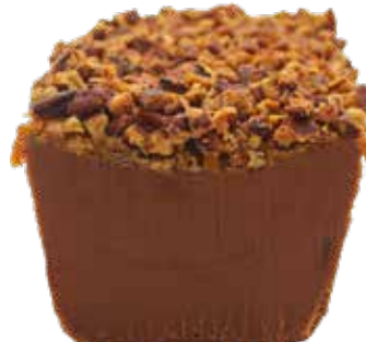
PECAN TURTLE TUR5