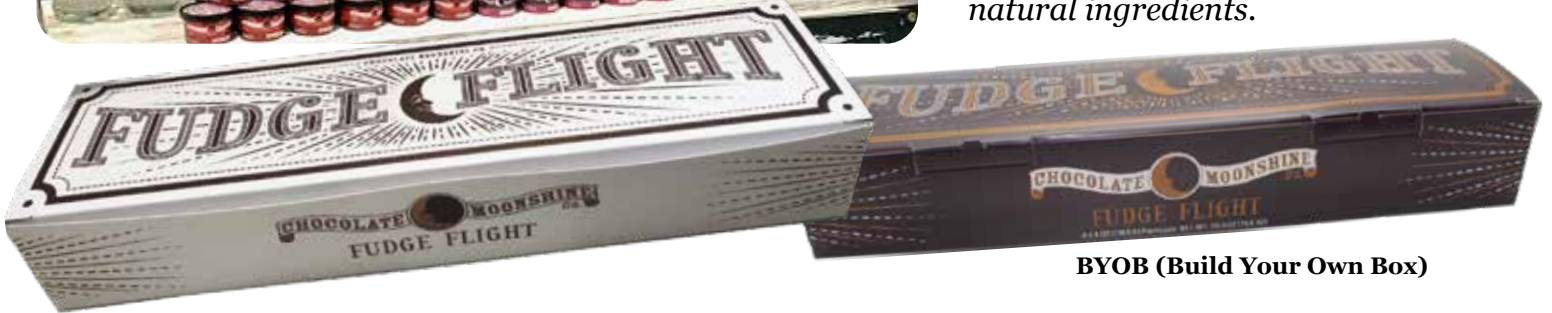
BYOB (Build Your Own Box)

Your customers can create their own Fudge Flight or choose from our Holiday or Classic Collections. Each flight box contains four 5 oz. Fudge Cups and is available in eleven different flavors. Our hand-poured fudge recipe consists of only the purest most natural ingredients.