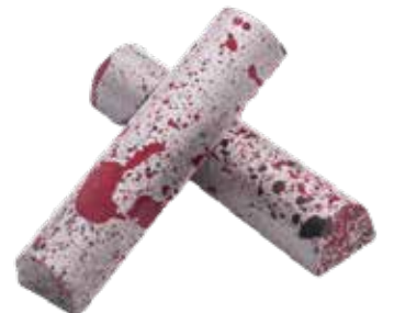
SPARKLING SHIRAZ SHI BAR