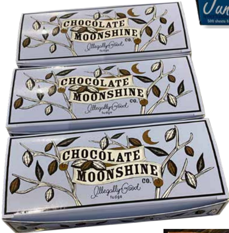
Auto-Fold Fudge Gift Boxes One Pound Available to ship in 50 / 100 / 200 Quantities