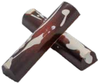
DARK SEA SALT CARAMEL SEA-D BAR