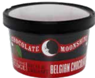
BELGIAN CHOCOLATE CHOCUP