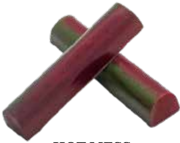
HOT MESS HOT BAR