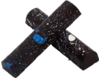
DARK ALMOND VIENNESE DAV BAR