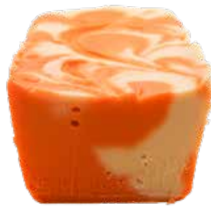
ORANGE CREAMSICLE CRM5