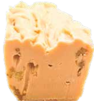
FRENCH VANILLA WALNUT VNT5