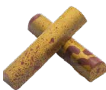
BANANA RUM BRUM BAR