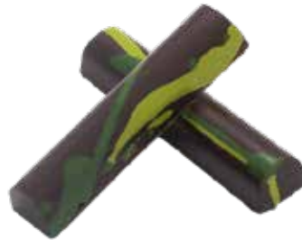
DARK PISTACHIO PST-D BAR