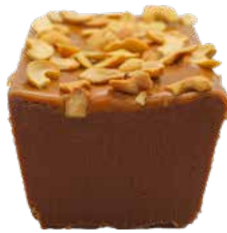
CASHEW TURTLE CAS5