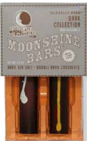
DARK Dark Sea Salt Caramel Dark Chocolate