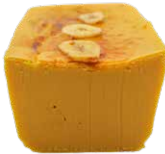
BANANA FOSTER FOS5