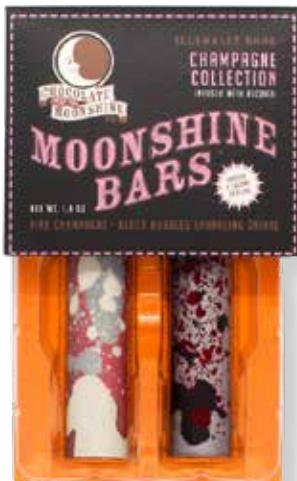
CHAMPAGNE Pink Champagne Sparkling Shiraz