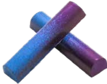
THE MOONSHINER (5 Blends of Moonshine) MOO BAR