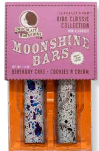
KIDS CLASSIC Birthday Cake Cookies 'N' Cream