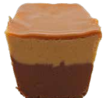
SALTED CARAMEL BOURBON SCB5