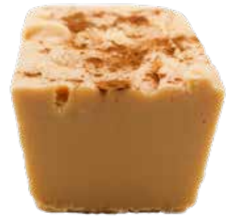
MOSCOW MULE MOS5