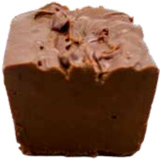
BELGIAN CHOCOLATE CHO5