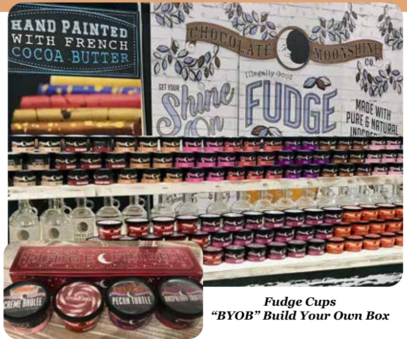
Fudge Cups "BYOB" Build Your Own Box

At Chocolate Moonshine we use fresh and natural ingredients that provide an unparalleled flavor and creamy texture that can only be created through the art of slow cooking in the micro-batch tradition.