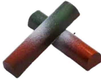
IRISH CREAM IRI BAR