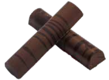
MILK CHOCOLATE PEANUT BUTTER PNB-M BAR