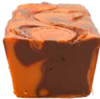
BARREL AGED WHISKEY BAW5