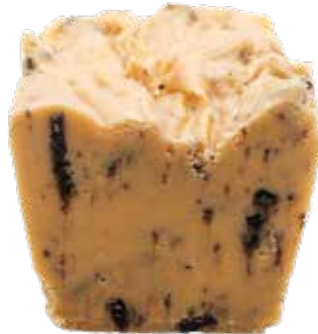
COOKIES 'N' CREAM CNC5