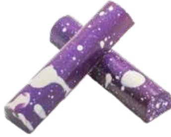
BLACK RASPBERRY BLK BAR