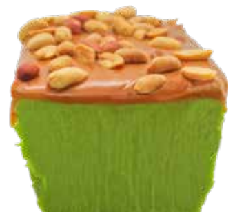
CARAMEL APPLE NUT CAN5