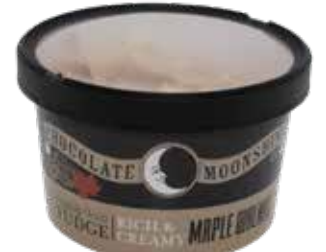
MAPLE WALNUT MNTCUP