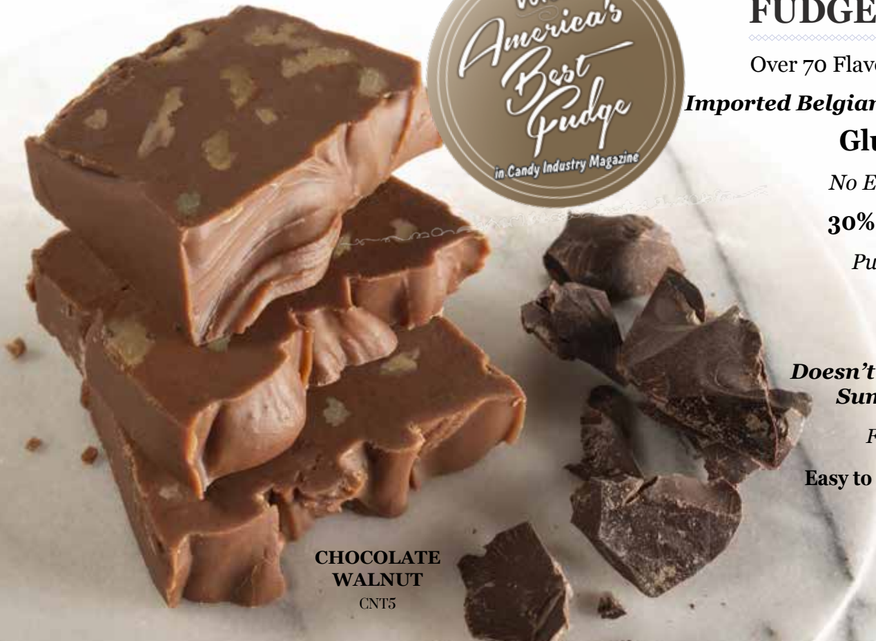
CHOCOLATE WALNUT CNT5