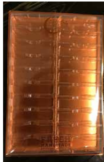
4-PACK TRAY Includes: Box, Tray, Backing & Universal Label

MOONSHINE BARS 10-PACK LABELS Collection Labels or "BYOB" Label Build Your Own Box!