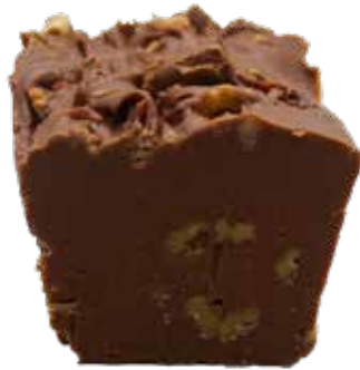
DOUBLE CHOCOLATE WALNUT DNT5