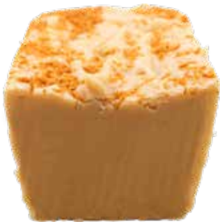
WHITE CHOCOLATE COCONUT WCO5