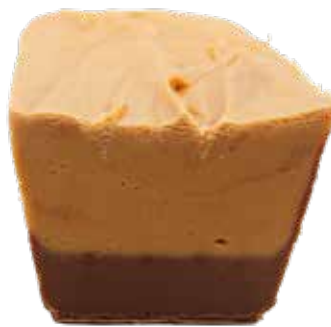
VEGAN CHOCOLATE PEANUT BUTTER VCPB5