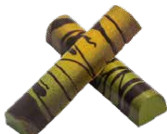
RUM RUNNER RUM BAR