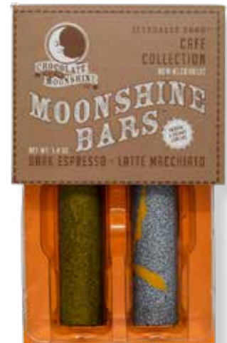
CAFE Dark Espresso Latte Macchiato