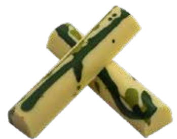
WHITE PISTACHIO PIST-W BAR