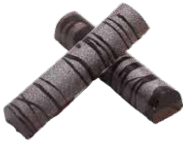
MOCHA MADNESS PNB-M BAR