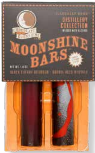
DISTILLERY Black Cherry Bourbon Barrel Aged Whiskey