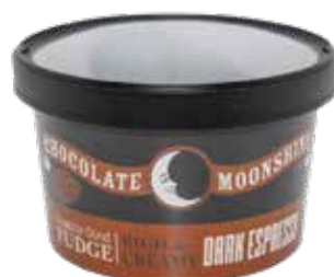
DARK ESPRESSO ESPCUP