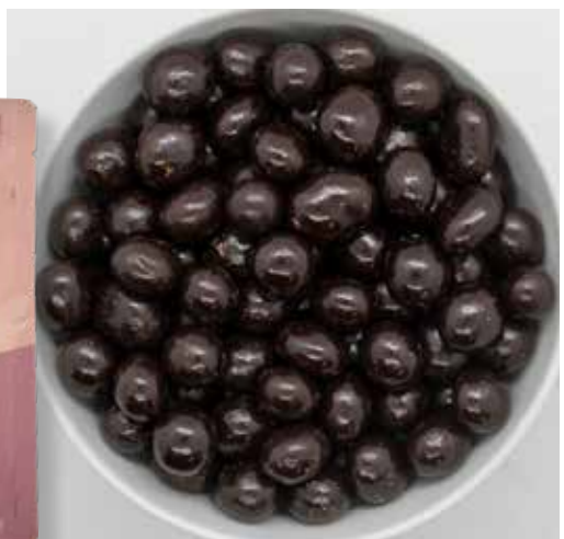
DARK CHOCOLATE ESPRESSO BEANS