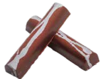
SEA SALT CARAMEL SEA-M BAR