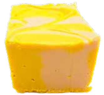
LEMON MERINGUE LEM5