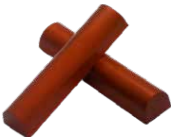
OLD FASHIONED OLD BAR