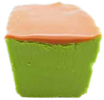
CARAMEL APPLE CAR5