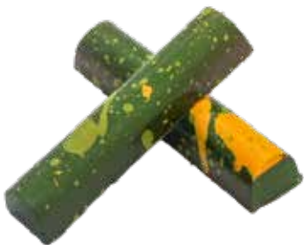
APPLE PIE MOONSHINE APM BAR