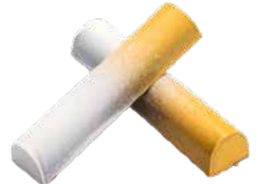
PINA COLADA PINA BAR