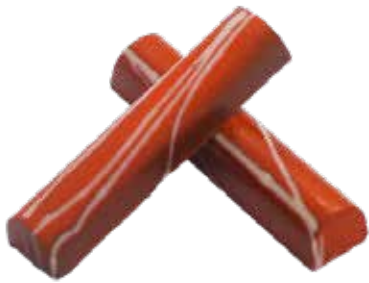
FRESH ORANGE ORG BAR