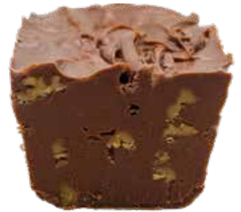
CHOCOLATE WALNUT CNT5