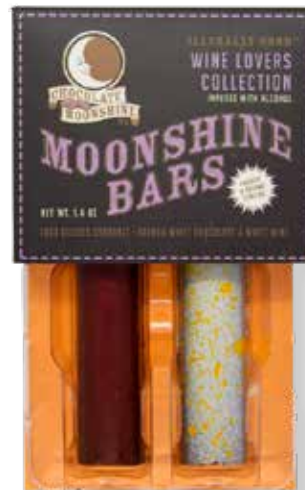
WINE LOVERS Cabernet White Wine