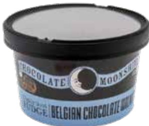
CHOCOLATE WALNUT CNTCUP