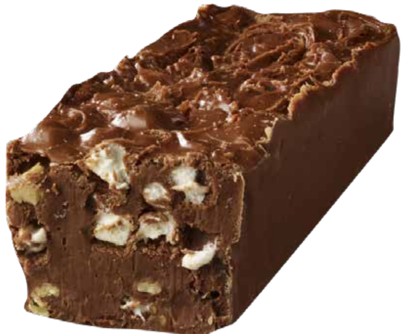
ROCKY ROAD ROC5