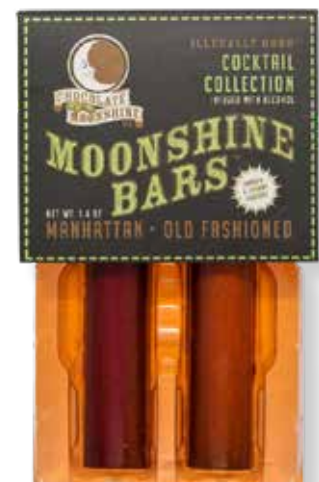
COCKTAIL Manhattan Old Fashioned