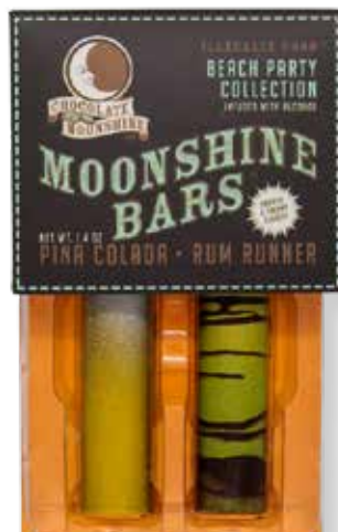
BEACH PARTY Pina Colada Rum Runner