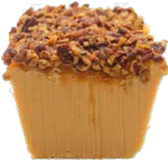
WHITE CHOCOLATE PECAN TURTLE WCT5