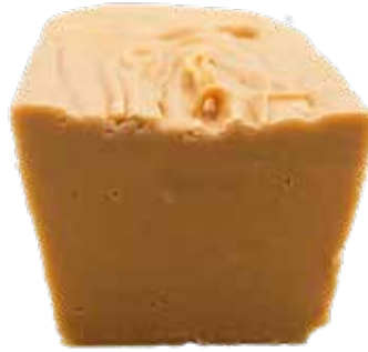
PEANUT BUTTER PNB5