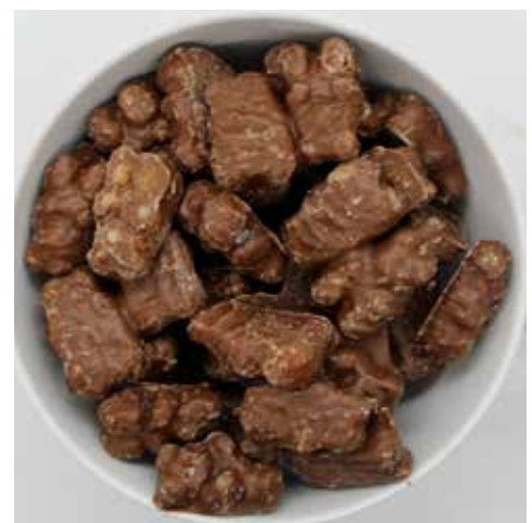
CHOCOLATE COVERED GUMMY BEARS