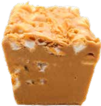
FLUFFER NUTTER (Peanut Butter Marshmallow) PBM5