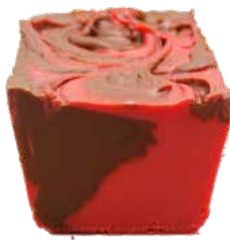
STRAWBERRY CHOCOLATE SWIRL SCS5