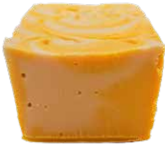
PINA COLADA PIN5