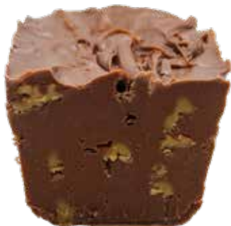
VEGAN CHOCOLATE WALNUT VCNT5