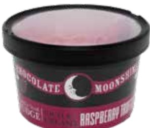
RASPBERRY TRUFFLE RASCUP