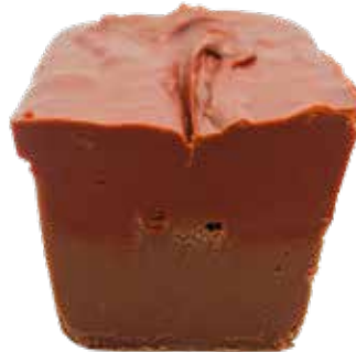
ORANGE BOURBON ORB5