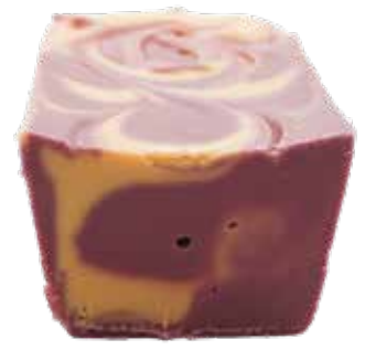
BLUEBERRY CHEESECAKE BLU5