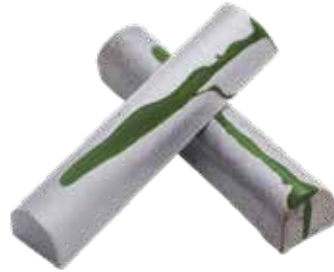
CHOCOLATE MINT MIN-M BAR