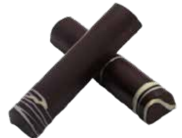
TIRAMISU TIR BAR