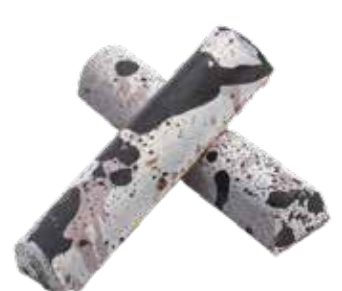
COOKIES 'N' CREAM CNC BAR