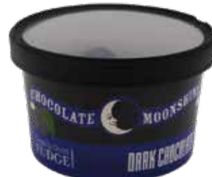
DARK CHOCOLATE DBLCUP