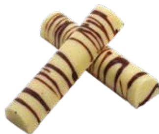
WHITE PEANUT BUTTER TIR BAR