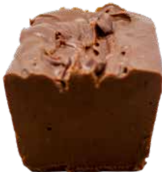
VEGAN BELGIAN CHOCOLATE VCH05