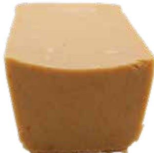
PENUCHE (Dulce De Leche)