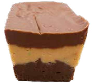
TRIPLE CHOCOLATE TRI5