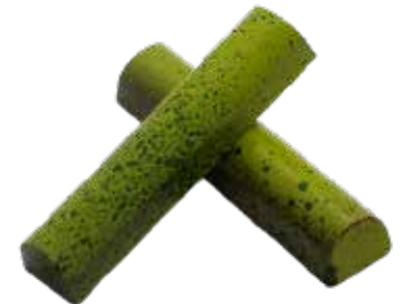
MOJITO PNB-M BAR