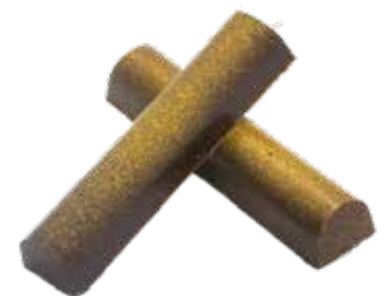
DARK ESPRESSO ESP BAR