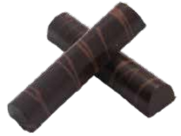
DARK CHOCOLATE PEANUT BUTTER PNB-D BAR