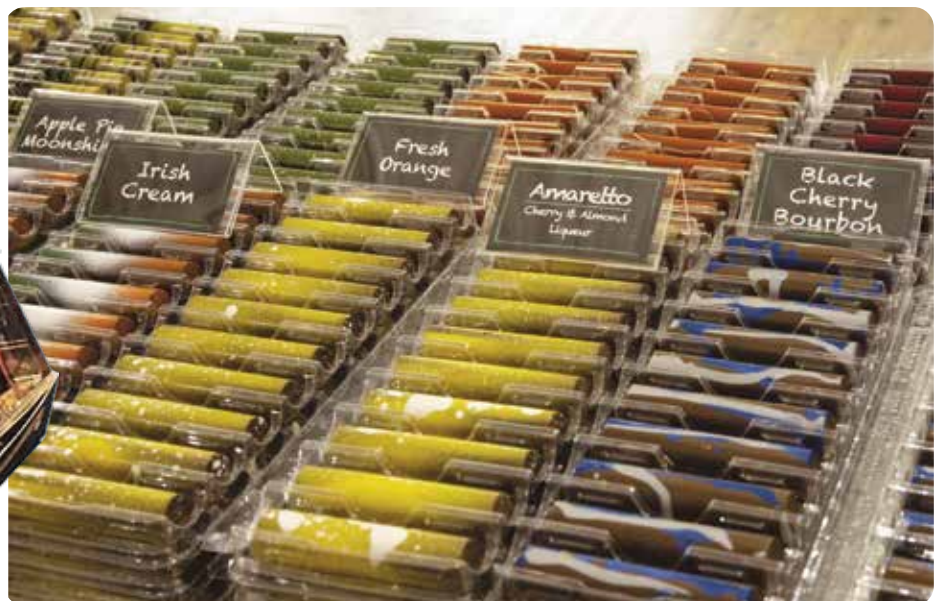
Moonshine Bars Bulk