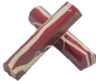
CHOCOLATE COVERED STRAWBERRY STR-M BAR