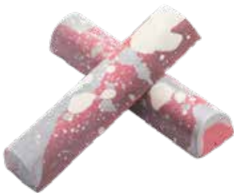
PINK CHAMPAGNE CHMP BAR