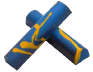
HAZELNUT HZL BAR