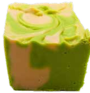
KEY LIME PIE KEY5