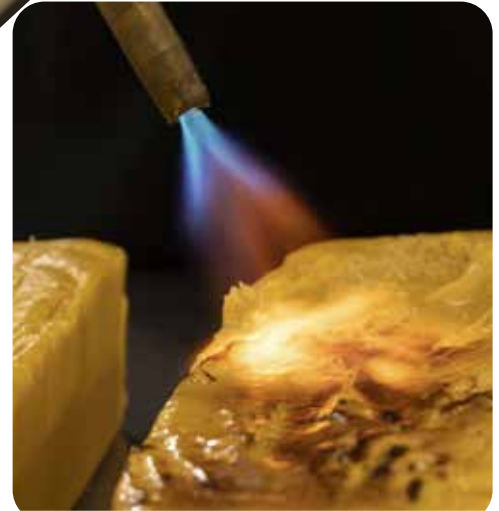
Creating CREME BRULÉE

Our fudge recipe was created over 30 years ago and has been known as America's Best Fudge since the early 80's. Our ingredients must be pure and natural. Our fudge will always be made in the small batch tradition, hand-stirred in copper kettles cooked over an open flame. This cooking method creates a wonderful silky smooth fudge that has been recognized as America's Finest.