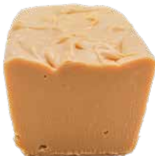
FRENCH VANILLA VAN5