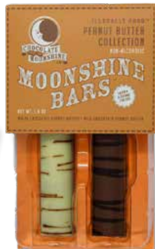
PEANUT BUTTER White Peanut Butter Milk Peanut Butter