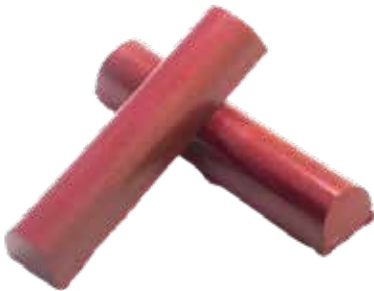
MANHATTAN MAN BAR