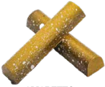
AMARETTO AMR BAR