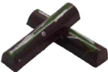
DARK MINT MIN-D BAR