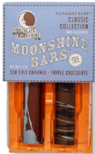
CLASSIC Sea Salt Caramel Triple Chocolate