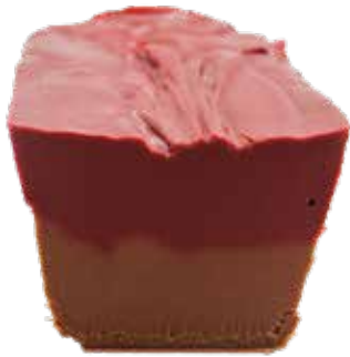
BLACK CHERRY BOURBON BCB5