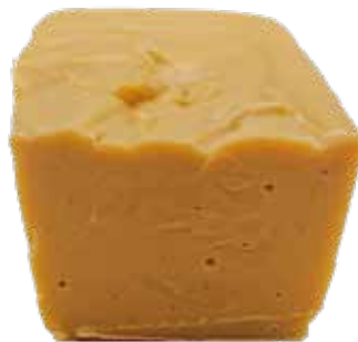
VEGAN PEANUT BUTTER VPNB5