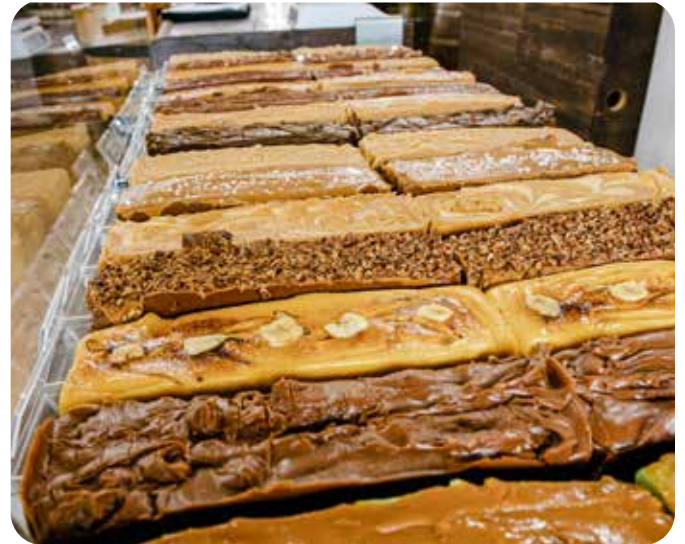
Bulk Fudge Display