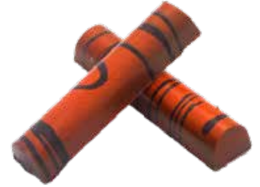
ORANGE BOURBON ORB BAR