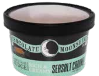
SEA SALT CARAMEL SEACUP