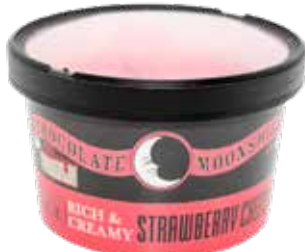
STRAWBERRY CHEESECAKE STRUCUP