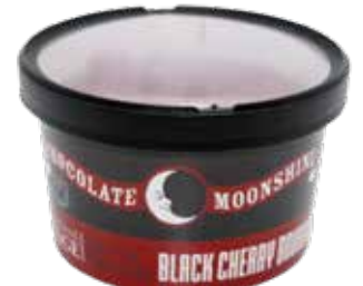
BLACK CHERRY BOURBON BCBCUP