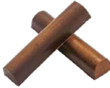
FUDGE BROWNIE FUD BAR