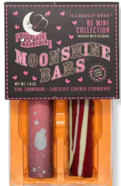
Be Mine! Pink Champagne Chocolate Covered Strawberry