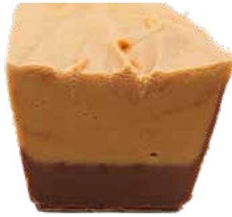
CHOCOLATE PEANUT BUTTER CPB5