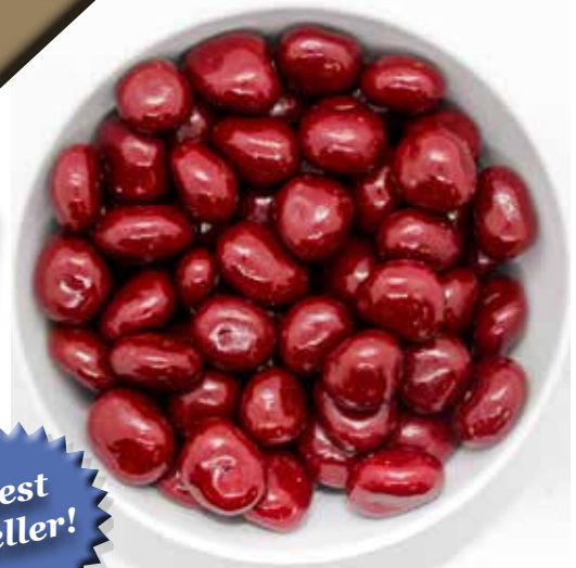
BLACK CHERRY BOURBON CHERRIES