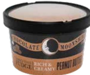
PEANUT BUTTER PNBCUP