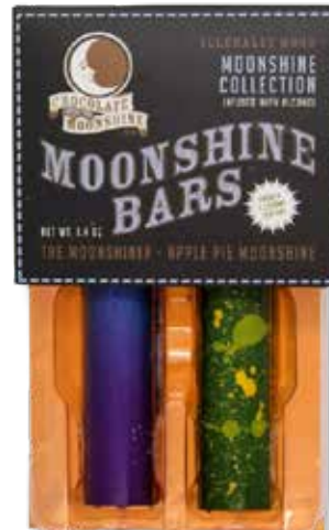
THE MOONSHINE The Moonshiner Apple Pie Moonshine