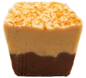
CHOCOLATE COCONUT CCO5