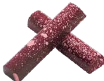
CRANBERRY POMEGRANATE CRA BAR