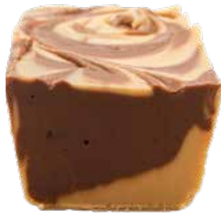
CHOCOLATE VANILLA SWIRL CVS5