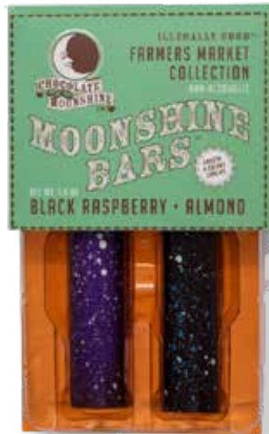
FARMERS MARKET Black Raspberry Dark Almond