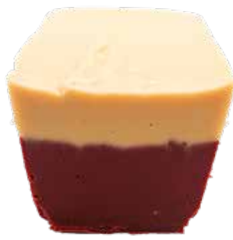
RED VELVET RED5