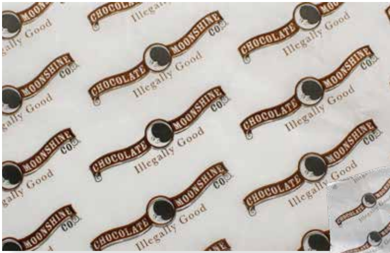
CHOCOLATE MOONSHINE DELI PAPER 8" x 10 3/4"

MOONSHINE BARS 4-PACK LABELS Collection Labels or "BYOB" Label Build Your Own Box!