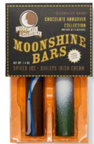
CHOCOLATE HANGOVER Spiked Joe Irish Cream