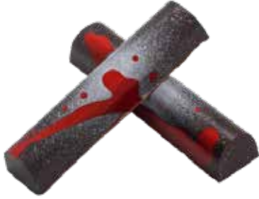
BARREL AGED WHISKEY BAW BAR