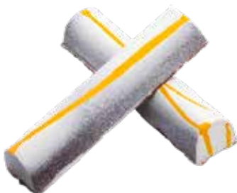
LATTE MACCHIATO LAT BAR