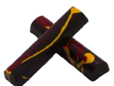
DECADENT CHOCOLATE CCC BAR