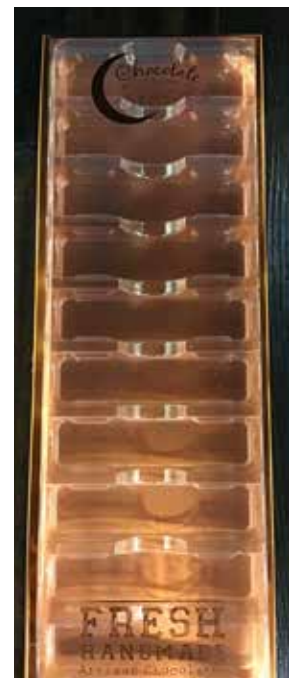
10-PACK TRAY Includes: Box, Tray, Backing & Universal Label

MOONSHINE BARS 10-PACK LABELS Collection Labels or "BYOB" Label Build Your Own Box!