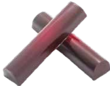
BLACK CHERRY BOURBON BLK BAR