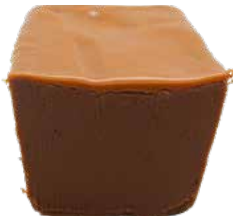
SEA SALT CARAMEL SEA5