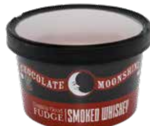
SMOKED WHISKEY SMOCUP