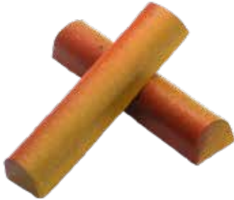
MIMOSA MIM BAR