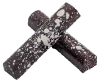
DARK COCONUT COC BAR