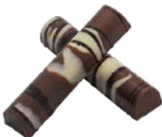
BAM! TRIPLE CHOCOLATE TRIP BAR