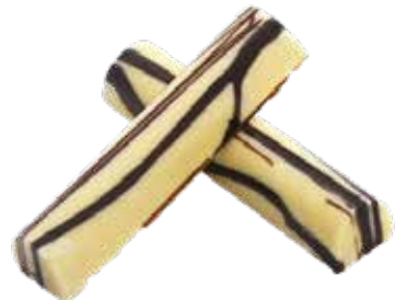
CHOCOLATE CHEESECAKE CCC BAR