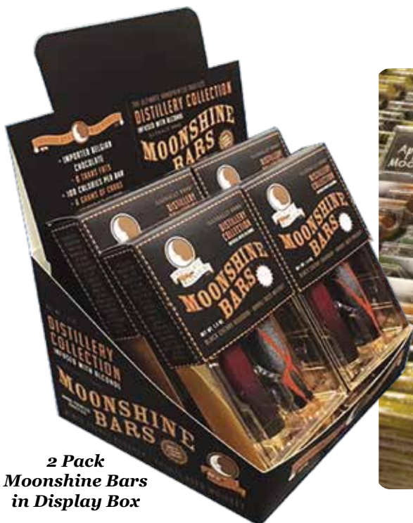
2 Pack Moonshine Bars in Display Box