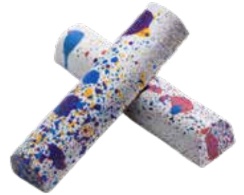
BIRTHDAY CAKE BIR BAR