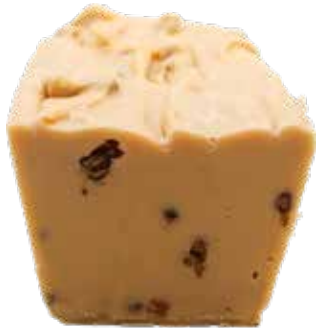
PENUCHE WALNUT PNT5