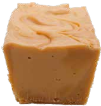
TIGER BUTTER (Vanilla and Peanut Butter) TIG5