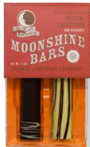
DESSERT Tiramisu Chocolate Cheesecake