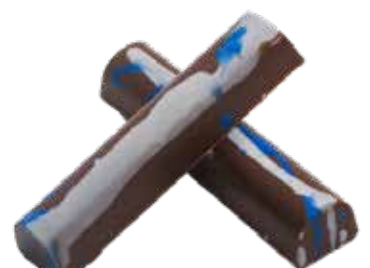
SPIKED JOE SPI BAR