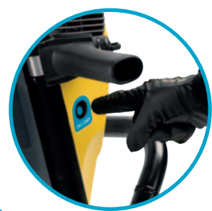
Easy is safe

If we had to choose one word to describe the Cobra™, it would be easy. It's easy to start, set up and move around. The decompression shown above is especially important when you are starting the machine.