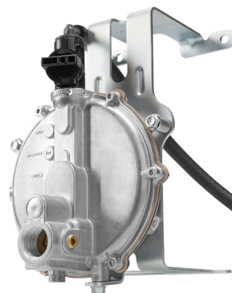
Tri-Fuel Regulator Kit

Propane is odorless and nontoxic. Clean-burning natural gas and propane cost less than gasoline and help reduce harmful carbon emissions.