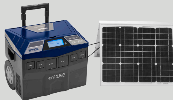
enCUBE battery inverter with 60-watt solar panel

With no engine or need for fuel, enCUBE® battery inverter is a clean power source with zero emissions, which means it can be used indoors. It charges through a 120-V AC wall outlet or optional solar panel (sold separately) and is perfect for camping, tailgating, or temporary outages at home. Built-in wheels and telescopic handles make it incredibly portable.