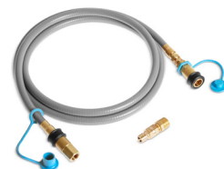
Tri-Fuel Natural Gas Hose (sold separately)