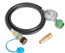
Tri-Fuel Propane Hose (sold separately)