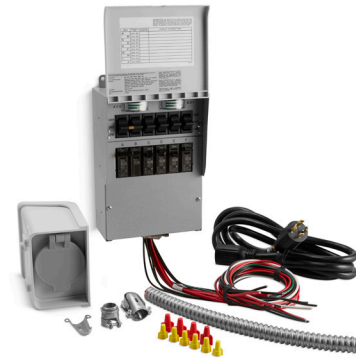
Six-Circuit Manual Transfer Switch

The manual transfer switch connects to your home's circuit panel so you can use your KOHLER® portable generator for home backup power. When the power goes out, plug your portable generator into the connection box, start the generator, and flip the switch. No cords, no hassles.