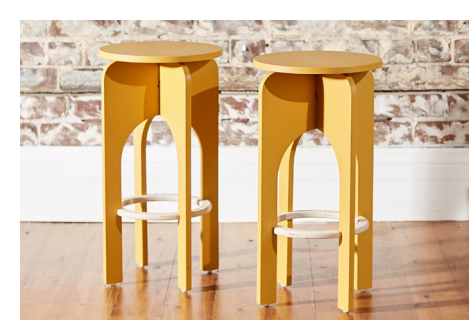
So Watt Bar Stools

Pegboards are an affordable, versatile and fun way to inject interest into your kitchen space. They also have the added bonus of being able to change as often as your possessions do.