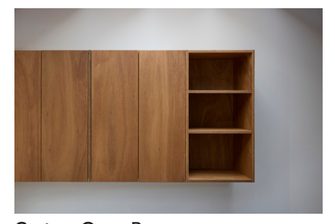
Custom Open Box

Personalise your kitchen with custom So Watt additions