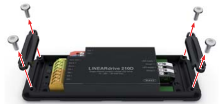
C Removing the strain reliefs