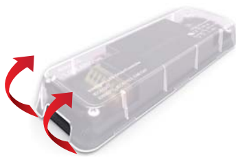
A Removing the cover