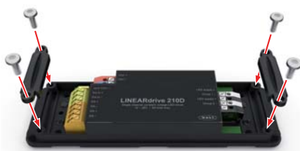
E Fastening the strain reliefs