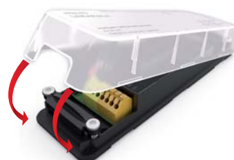
F Replacing the cover