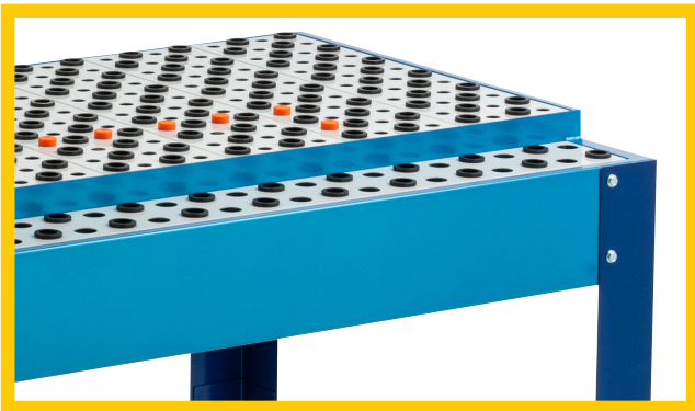
Heavy-duty steel frame construction for long-lasting durability.

For more information visit www.southbendtools.com/pages/warranty