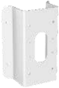
DS-1476ZJ-Y Corner Mount