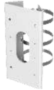
DS-1475ZJ-Y Vertical Pole Mount

* Product specifications may change without prior notice.