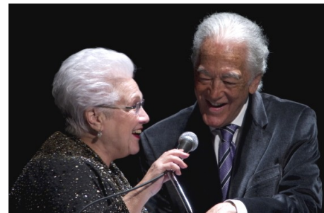
Marilyn Horne & Richard Bonynges