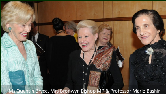
Ms Quentin Bryce, Mrs Bronwyn Bishop MP & Professor Marie Bashir