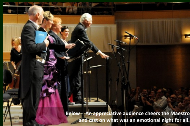
Below - An appreciative audience cheers the Maestro and cast on what was an emotional night for all.