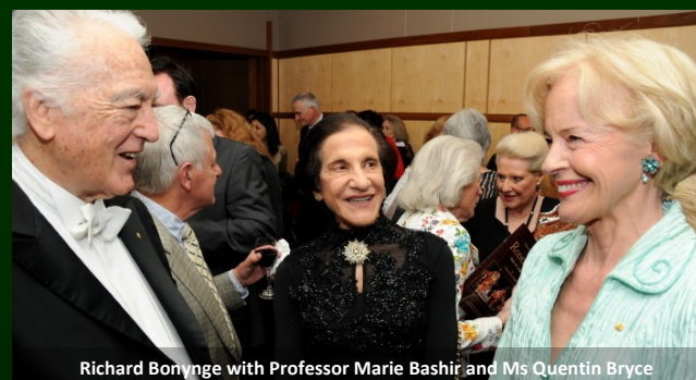
Richard Bonynge with Professor Marie Bashir and Ms Quentin Bryce