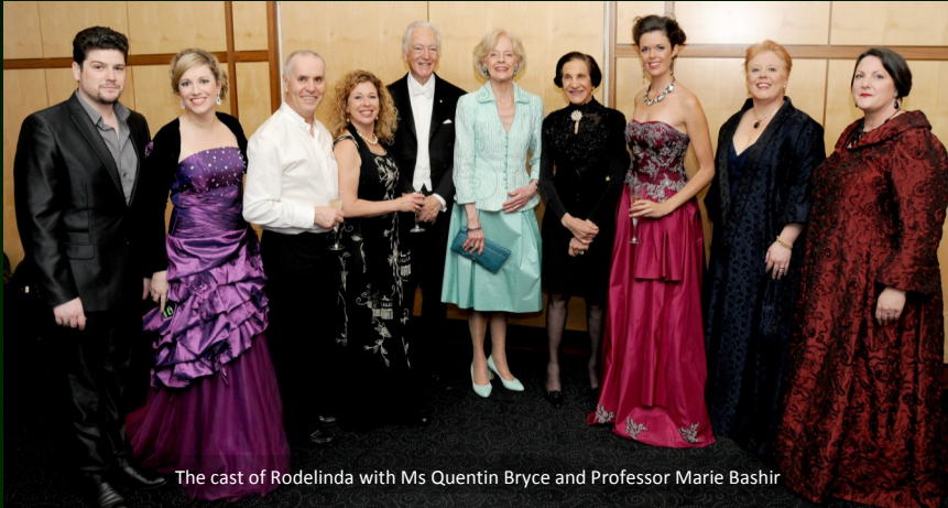
The cast of Rodelinda with Ms Quentin Bryce and Professor Marie Bashir