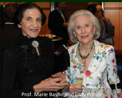
Prof. Marie Bashir and Lady Potter