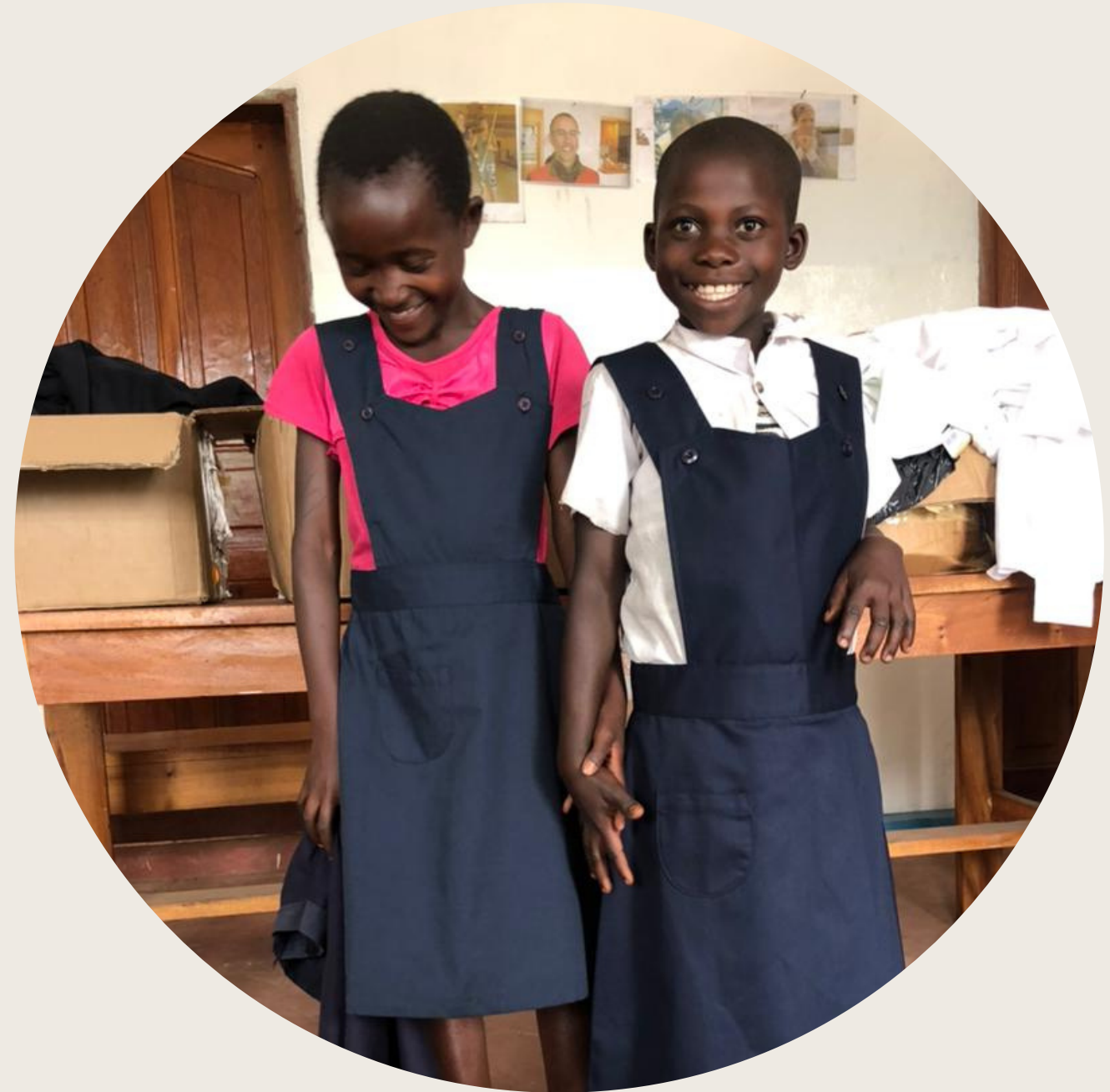
The Jonathan Holiday School