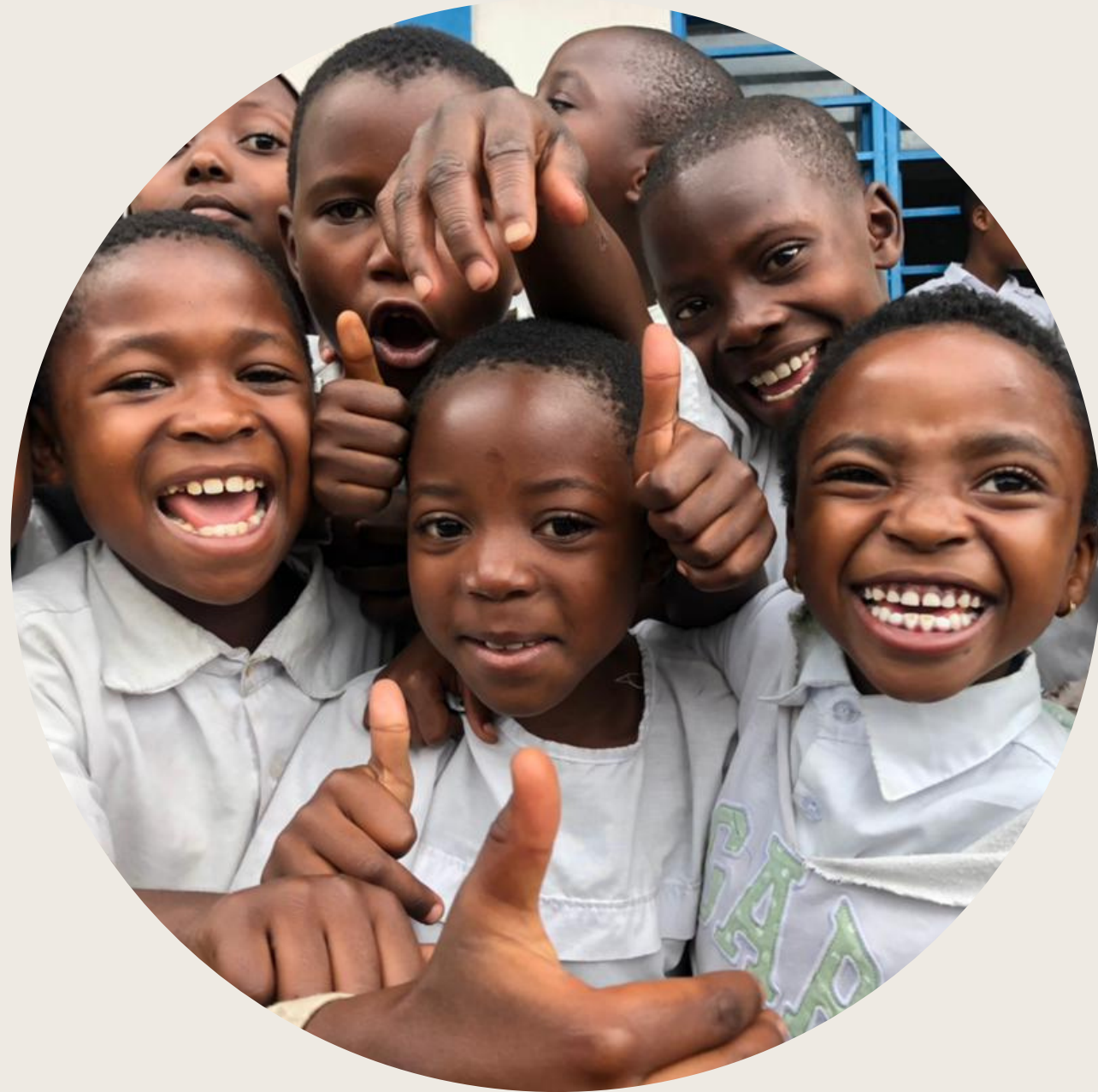
The Tchukudu Kids Home