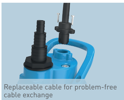
Replaceable cable for problem-free cable exchange