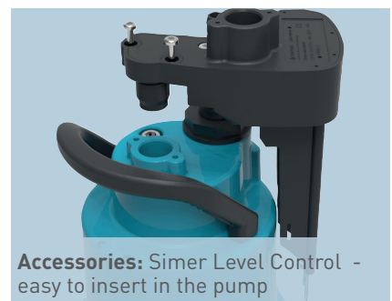
Accessories: Simer Level Control - easy to insert in the pump