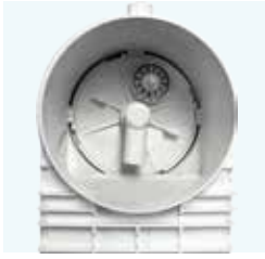
Vacuum Plate with Flow Control