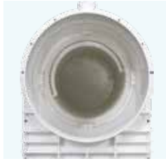
Massive 6.7L Leaf Basket