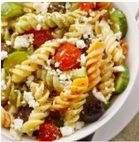
MEDITERRANEAN PASTA SALAD 🌿 With olives, feta, tomatoes and cucumbers