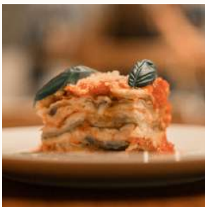
EGGPLANT PARMIGIANA 🌿