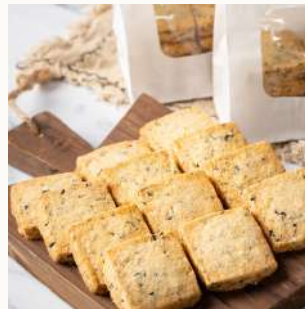
EARL GREY COOKIES