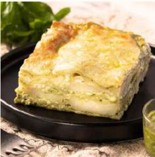
VEGETARIAN LASAGNA 🌿