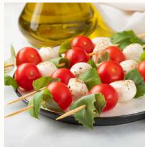
CAPRESE SALAD OF FRESH MOZZARELLA AND TOMATO 🌿