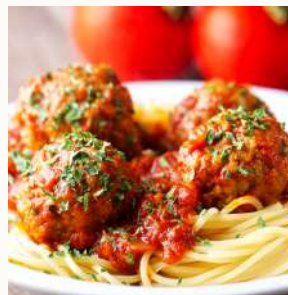
FRESH PASTA WITH BEEF MEATBALLS