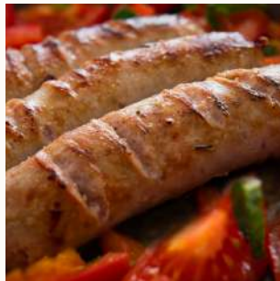
PORK SAUSAGE AND SWEET PEPPER