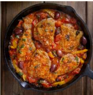
CHICKEN CACCIATORE With Peppers, mushroom and Tomato Sauce