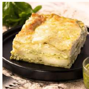
PESTO AND POTATO LASAGNA 🌿