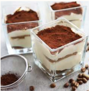
MINI TIRAMISU CUPS