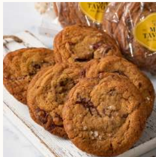
CHOCOLATE CHIP COOKIES