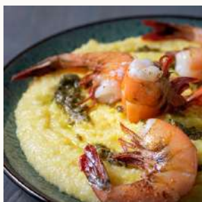
MEATBALLS/ SHRIMP OVER CHEESY POLENTA