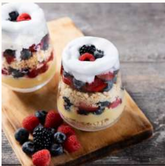
INDIVIDUAL BERRY TRIFLES