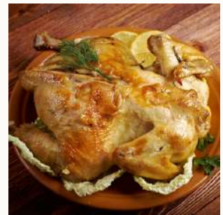
CHICKEN ALLA DIAVOLA Spicy Roasted Chicken