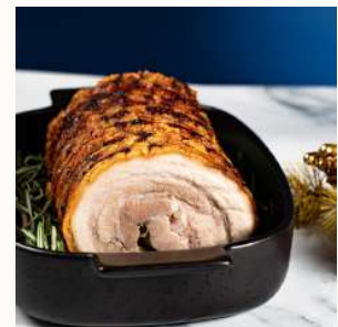
ROASTED PORCHETTA WITH ROSEMARY POTATOES