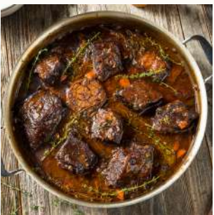
BRAISED SHORT RIBS WITH POLENTA