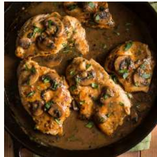
CHICKEN MARSALA WITH MUSHROOM