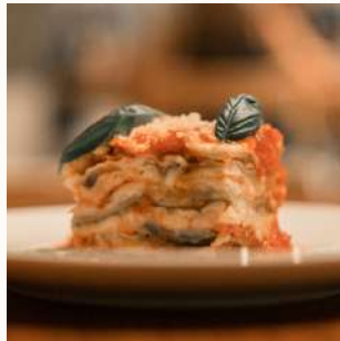
EGGPLANT PARMIGIANA 🌿