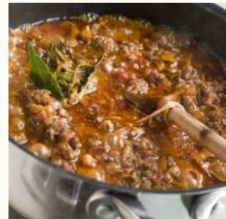
NEAPOLITAN RAGU Meatballs, rolled beef involtini and pork ribs in a rich tomato sauce