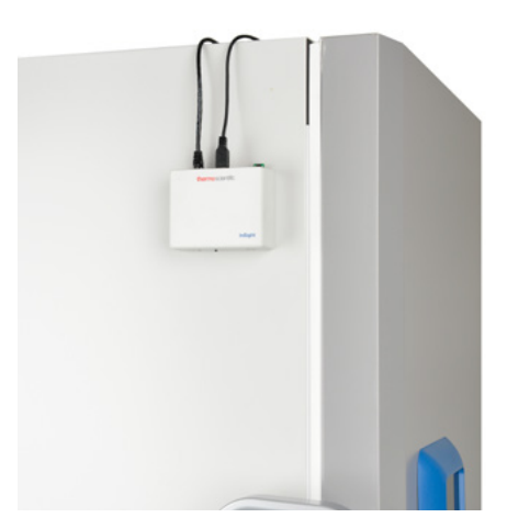
Step 1 – Connect device-specific sensors to your device

InSight remote monitoring and asset management solution mounted on your laboratory equipment.