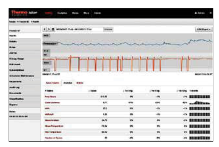
Step 3 – Access the web app to monitor your device and receive notifications based on the thresholds configured or the advanced data analytics

InSight remote monitoring and asset management solution mounted on your laboratory equipment.