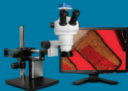
OPTICAL TEL:1(800)216-1800 & PRESS 2

CONTACT OUR PRODUCT DIVISIONS TO LEARN MORE ABOUT OUR LARGE VARIETY OF INSPECTION PRODUCTS