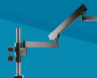
SB-CL2-FX* HEAVY DUTY ARTICULATING STAND