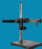
SB-BM2-R0* GLIDING BOOM STAND