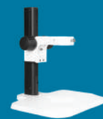
ST-76-LG ERGO TRACK STAND