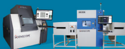
X-RAY & COMPONENT COUNTING TEL:1(800)216-1800 & PRESS 2