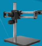
SB-BM2-D0* DUAL BOOM STAND