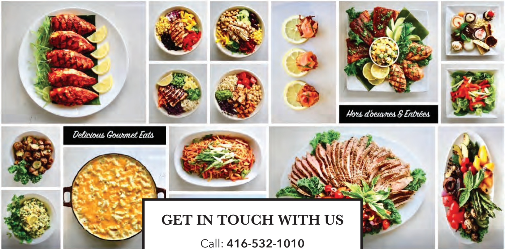
Delicious Gourmet Eats