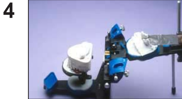
Add plaster to plastic index plate and study cast to mount models in usual manner.