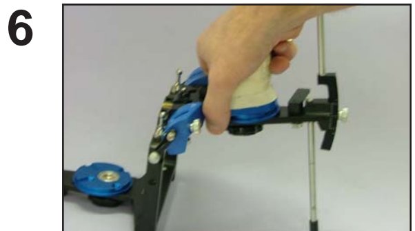
To prevent casts from separating from mounting plate, grasp the cast and mounting plate with thumb and fingers. Tilt the mounted cast assembly sideways to release cast from mounting plate magnet. (Do not pull on mounted casts.)

Check to make sure your magnet is still on your articulator, without a magnet, your stone transfer plates will not connect.