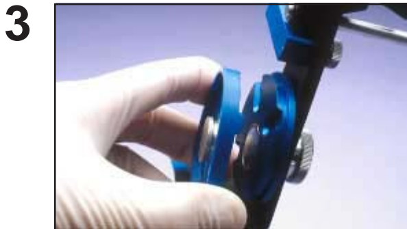
Place plastic index plate to metal magnetic mounting plate.