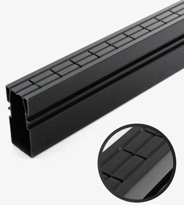
2mm Inlet Slots

Manufactured from High Density Polyethylene the TH MONO is durable, light-weight, and has an aesthetic black finish. With it's intergrated grating and discreet 2mm inlet slots this channel is ideal for smaller urban projects.