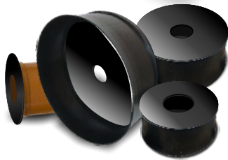
Orifice plates are manufactured to suit outlet pipework and can be changed easily if different orifice size is required