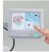
Touch Panel 999 patterns memory 40,000,000 stitches memory