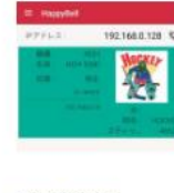
HAPPY BELL Mobile Device Application for machine status notification