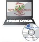
Editing function in HAPPY LAN/LINK software