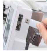
USB and Mouse