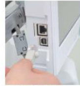
LAN and USB connection