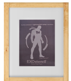
EXOSTENCIL® Screen Prep Paper