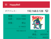
HAPPY BELL Mobile Device Application for machine status notification