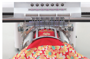
One Point Frames