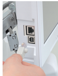
LAN and USB connection