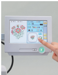
Touch Panel 999 patterns memory 40,000,000 stitches memory