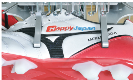
Shoe Clamp Frame (60×100mm)