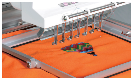
Manual Clamp Frame (Large:150×300mm Small:150×150mm)