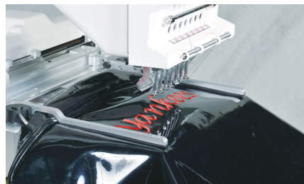
Side Clamp Frame (140×220mm)