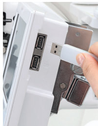
USB and Mouse