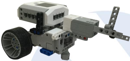
South China sea defender