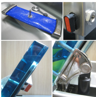
SEALING BAR 12.4 inch VACUUM PUMP 282 cf/h

The basic model Multiple 315H, made entirely of AISI304 stainless steel, equipped with a digital control panel, stands out for its extreme robustness, ease of use and compactness. Its versatility makes it possible to package the products in the chamber, in external containers via the suction device and in embossed envelopes outside the chamber. The quality and proven reliability of the machine and its components derives from the over twenty-year widespread presence on the global market, in all areas and all sectors.