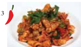
13 Stir Fried Squid ..... 20 95 오징어볶음 Stir fried squid & vegetables, in a red chili sauce