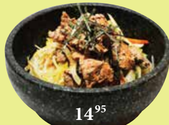
B6 Bulgogi Bibimbap