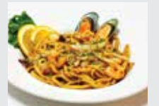
N4 Seafood Yaki Udon ..... 15 95