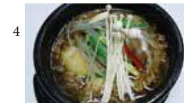
4 Bulgogi mushroom soup 15 95 불고기버섯찌개 Bulgogi and mushroom soup w/ sweet soy sauce