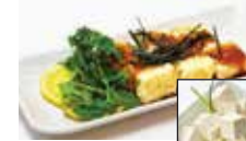
2 Tofu Teriyaki ..... 6 95 Deep fried tofu served with dried seaweed