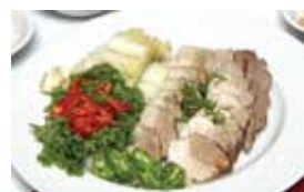
Bossam .... 32 95 보쌈