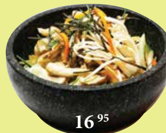
B8 Mushroom Bibimbap