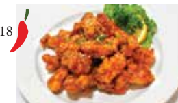
18 Sweet & Spicy Chicken 15 95 간풍기 Deep fried chicken w/ chili sauce