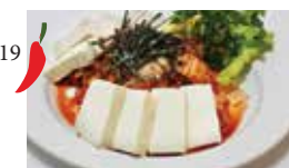
19 Tofu Kimchi ..... 19 95 두부김치 Stir fried kimchi, tofu and pork