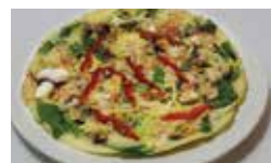
24 Seafood Pancake .... 16 95 해물파전 Korean pancake w/ seafood and assorted vegetables