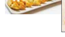
3 Gyoza ..... 6 95 Deep fried vegetable dumplings