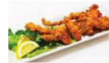
Mini Gyoza ..... 7 95 chicken & cilantro (10pcs)