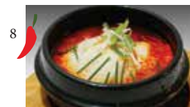
8 Soft Tofu Stew ..... 11 95 순두부찌개 Spicy soft tofu stew, choice of (Seafood or Beef)