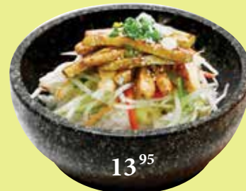
B4 Chicken Bibimbap or Spicy Chicken