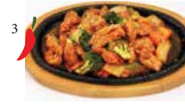
3 Spicy Chicken ..... 17 95 닭칠판볶음 (add cheese) 3 95 Pan fried chicken & vegetables w/ hot sauce