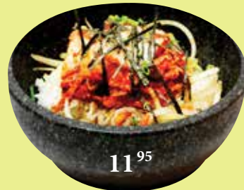
B2 Kimchi Bibimbap