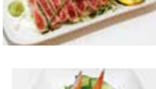
7 Beef Sashimi ..... 16 95 Finely sliced rare sirloin with special sauce