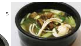
5 Kalbi Ribs Soup ..... 15 95 갈비탕 (add Ginseng) ..... 4 95 Soup made w/ simmered beef rib, vegetables & egg