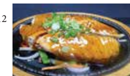
12 Teriyaki ..... 16 95 Chicken or Salmon with Teriyaki sauce with hot plate (Chicken or Salmon)