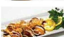
5 Calamari ..... 10 95 Lightly battered & deep fried squid rings