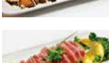
6 Takoyaki ..... 11 95 Japanese-style octopus, deep fried & drizzled w/ Japanese sauce