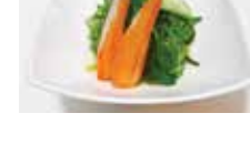
8 Wakame Salad ..... 6 50 Seaweed Salad