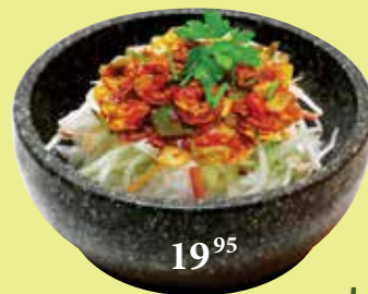
B9 Squid Bibimbap