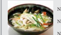
N1 Seafood Udon Soup .... 14 95 N2 Vegetable Udon Soup .... 10 95 N3 Tempura Udon Soup ..... 15 95