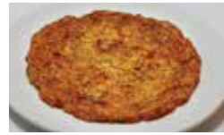
23 Kimchi Pancake ..... 14 50 김치전 Korean pancake w/ kimchi and assorted vegetables