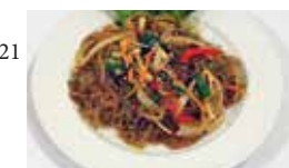
21 Jap-Chae ..... 12 95 잡채 (w/Beef) ..... 16 95 sweet potato noodles stir fried with vegetables