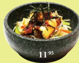
B10 Tofu Bibimbap