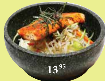
B3 Salmon Bibimbap