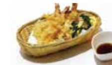
9 Tempura ..... 8 95 Deep fried 2pcs of shrimps + 5pcs of vegetables Shrimp Only (5pcs) ..... 8 95