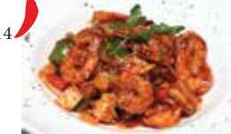
14 Stir Fried Shrimp ..... 21 95 새우볶음 Stir fried shrimp & vegetables, in a red chili sauce