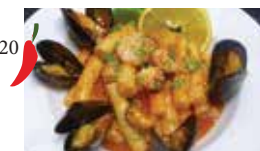
20 Rice Cake (seafood) ..... 14 95 Rice Cake (beef) ..... 13 95 떡볶이 (add cheese) ..... 3 95 (add noodle) ..... 3 50 Rice cakes served w/ spicy sauce