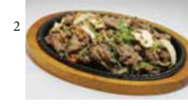
2 Bulgogi ..... 19 95 불고기 Marinated, sliced beef cooked w/ vegetables