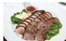
JokBal .... 27 95 족발