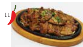
11 Stir Fried Pork ..... 19 95 제육볶음 Stir fried marinated pork w/ spicy sauce