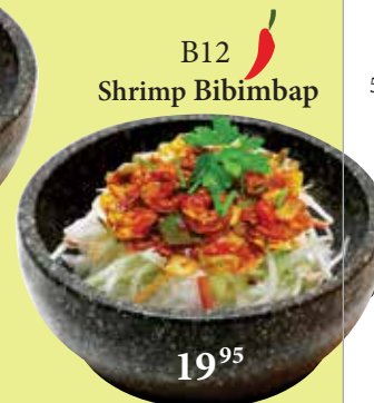
B12 Shrimp Bibimbap