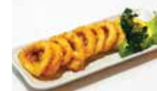
4 Soft Shell Crab ..... 16 95 Deep fried soft shell crab