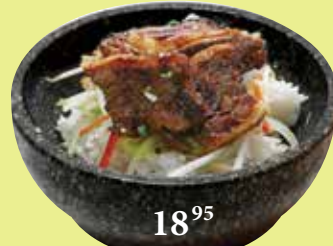
B5 L.A. Ribs Bibimbap