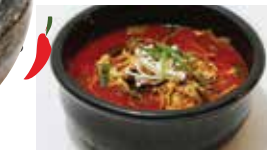
Spicy Beef Soup ..... 14 95 육개장 Spicy soup w/ beef, vegetables, sweet potato noodles & egg