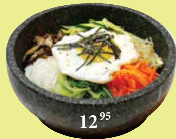
B1 Classic Bibimbap w/Beef or Vegetables Bibimbap

$1.45 extra for an egg / $3.95 extra for cheese $4.96 extra for vegetable