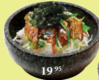
B11 Eel Bibimbap