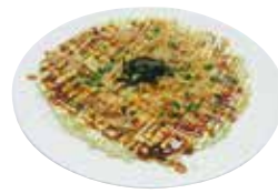
24 Okonomi Pancake... 16 95 Japanese style pancake choice of vegetable, pork or kimchi