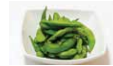
1 Edamame ..... 4 50 Steamed Japanese soybeans sprinkled w/ salt