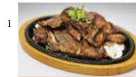
1 L.A. Ribs ..... 32 95 갈비 Marinated, grilled Korean-style beef short ribs