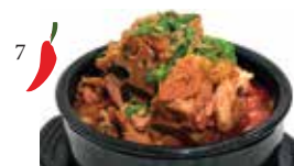
7 Pork Bone Soup ..... 12 95 감자탕 Spicy pork bone soup w/ potatoes