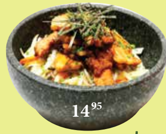
B7 Pork Bibimbap