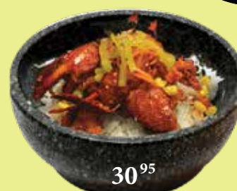
B13 Lobster Bibimbap