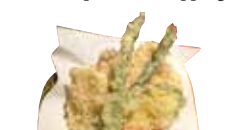
11 Vegetable Tempura ..... 7 99 Deep fried 8pcs of vegetables