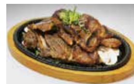
LA Ribs ..... 16 00 갈비 Appetizer portion