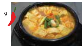
9 Soybean Stew ..... 10 95 된장찌개 Soybean stew w/ seafood & various vegetables