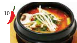
10 Kimchi Stew ..... 13 95 김치찌개 Spicy stew made w/ kimchi, tofu & pork