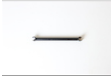
Tensioning Rod (12)