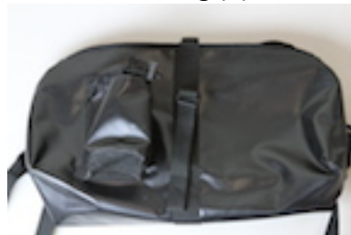
Side Bag (2)