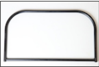
Rear bag side rail (2)