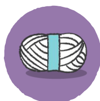
Orange medium-weight yarn (13 yds)