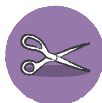
Scissors (not included)